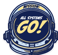
KJELL LINDGREN, MD NASA ASTRONAUT