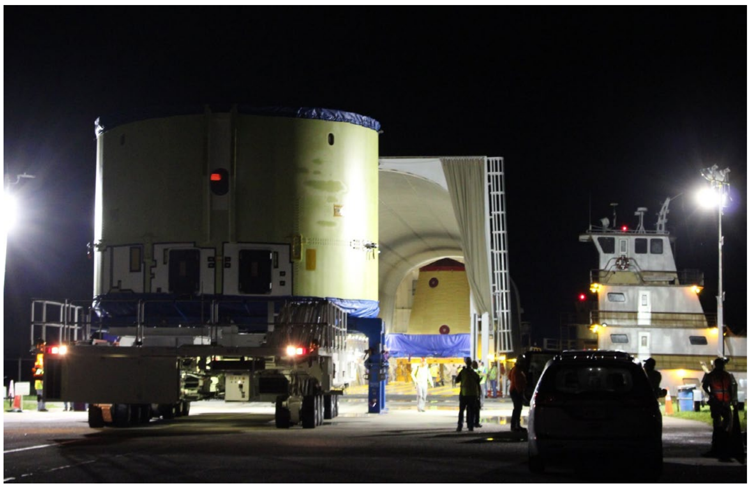
The Artemis IV core stage engine section, Artemis III core stage boattail, and Artemis II launch vehicle stage adapter are unloaded off the Pegasus barge at NASA's Kennedy Space Center in Florida.

ASA is making strides with the Artemis campaign as key components for the SLS rocket continue to make their way to NASA Kennedy. Teams with NASA and Boeing loaded the core stage boattail for Artemis III and the core stage engine section for Artemis IV onto the Pegasus barge at NASA Michoud Aug. 28. The hardware arrived at Kennedy Sept. 5.