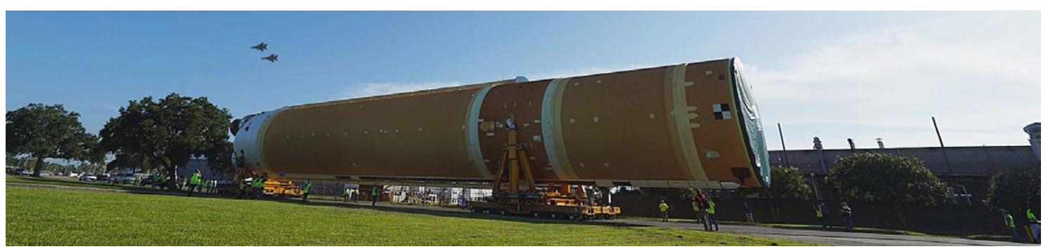
Two F-15 Strike Eagle fighter jets from Naval Air Station Joint Reserve Base New Orleans in Belle Chasse, Louisiana, fly over the Artemis II SLS core stage during its transportation to the Pegasus barge at NASA's Michoud Assembly Facility in New Orleans July 16.