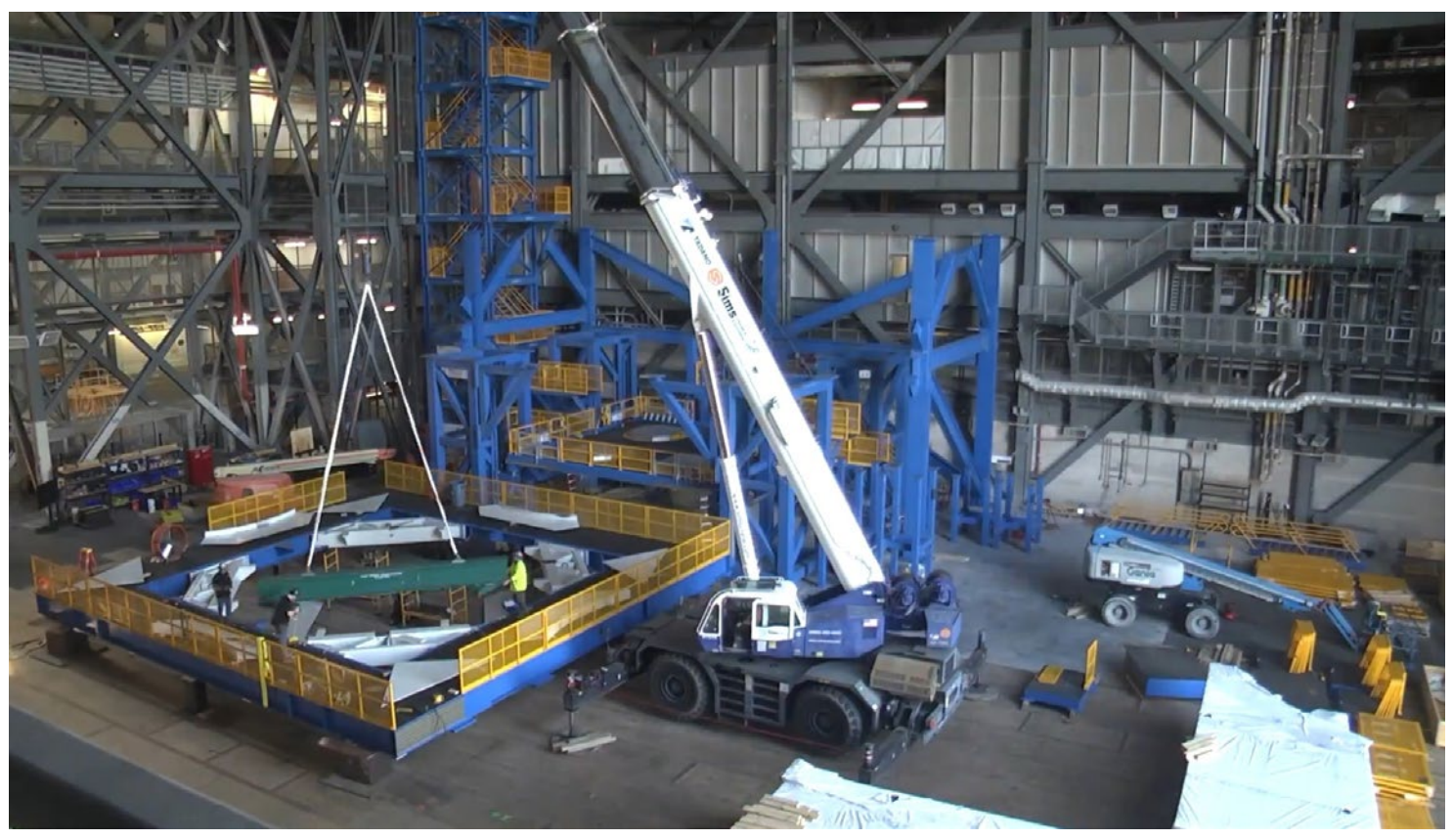
Teams at NASA's Kennedy Space Center in Florida have been updating High Bay 2 in the Vehicle Assembly Building to allow for vertical assembly of the SLS core stage beginning with Artemis III. All major structures for the core stage will continue to be produced and manufactured at NASA's Michoud Assembly Facility in New Orleans. Watch the video here: bit.ly/408kXOZ