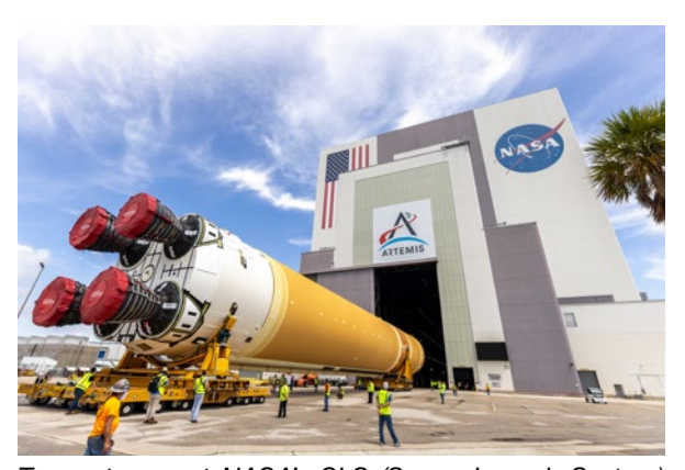
Teams transport NASA's SLS (Space Launch System) core stage into the Vehicle Assembly Building at the agency's Kennedy Space Center in Florida July 24, 2024.