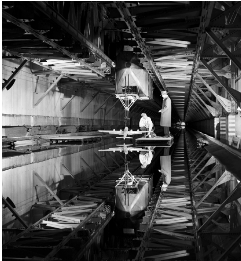
B-29 Ditching Test, Tow Tanks Building 720; 1946

http://crgis.ndc.nasa.gov/historic/File:L-43585.jpg