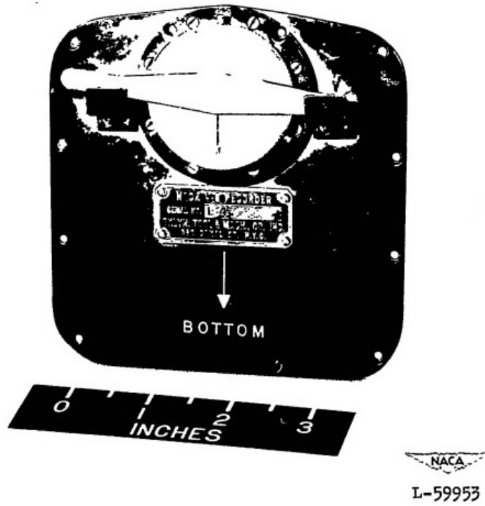
Figure 2(a) – V-G Recorder – Front (above) Cover Removed (below)