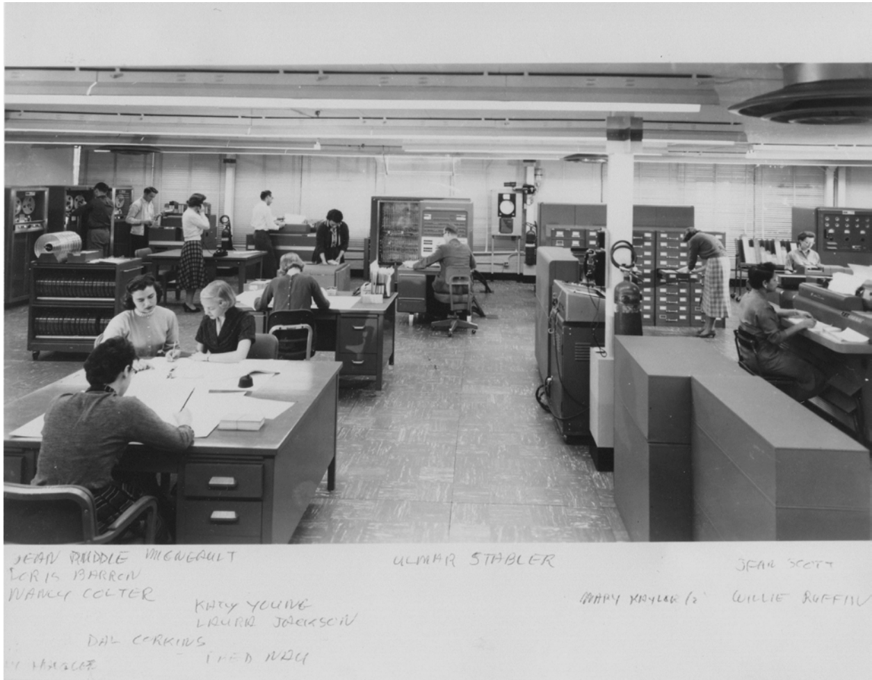
Figure 1 - Human Computers; Women at NACA and early NASA. Typical computing area.