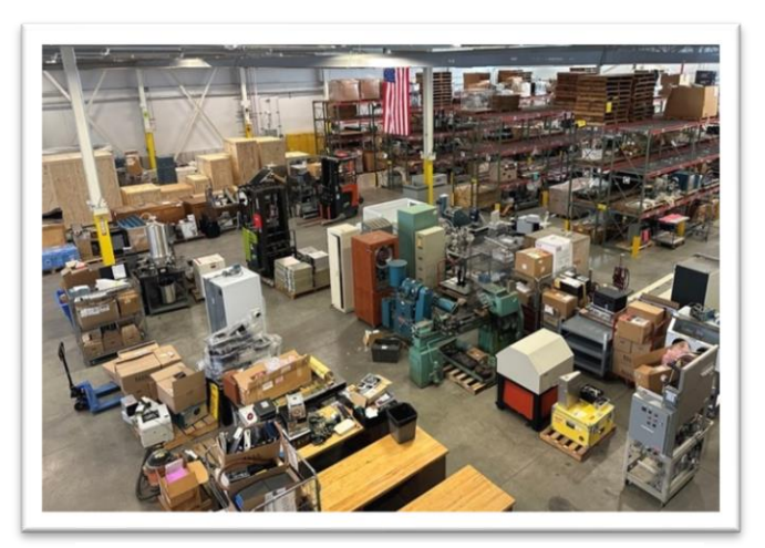
GRC Property Reutilization Warehouse

Recognized for demonstrated teamwork and ingenuity in reutilization of excessed property and reduced waste as part of the GRC Property Reutilization Team.