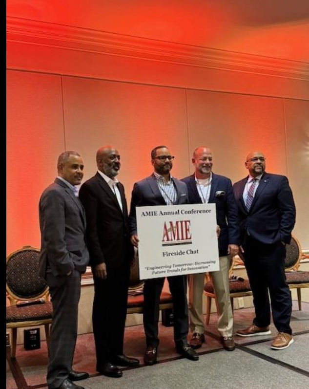
AMIE Annual conference September 2024, NC A & T