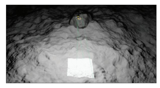
Oct. 5 · Astrobotic

MoonFALL • Bronco Space (Cal Poly Pomona) This was the third flight in our TechLeap Nighttime Precision Landing Challenge