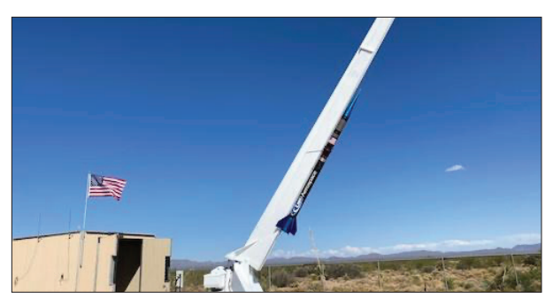
More information about this flight test will be added to our website soon!