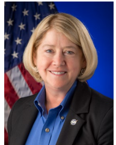
Pam Melroy Deputy Administrator National Aeronautics and Space Administration