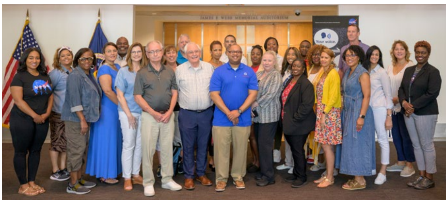
The Office of Small Business Programs