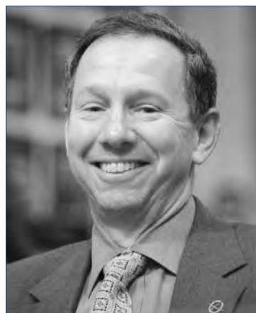
Michael Griffin, 11th Administrator of NASA, at his Senate confirmation hearing on 12 April 2005.

Michael D. Griffin was sworn in as the 11th Administrator of NASA on 14 April 2005. In a special address at NASA Headquarters, Griffin expressed his commitment to the President’s Vision for Space Exploration and to maintaining “vigorous programs in both robotic and human space exploration, as well as in Earth science and aeronautics.” His priorities also include: flying the Shuttle safely until its retirement in 2010; completing the International Space Station; encouraging partnerships with private industry; putting a new Crew Exploration Vehicle into service; and establishing a lunar return program. Griffin emphasized his confidence in the ability of NASA to maintain strong, well-balanced programs in science, exploration, and aeronautics within the context of the Vision for Space Exploration.