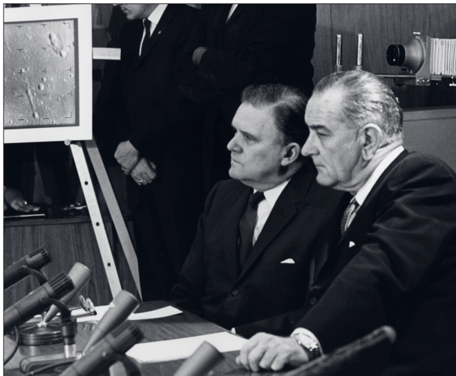
President Johnson at the Mariner 4 briefing with NASA Administrator James Webb.