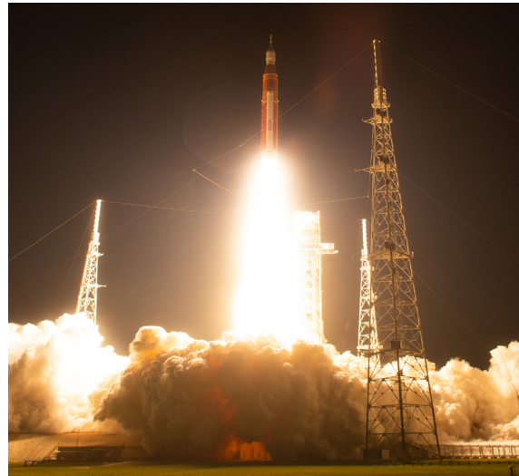
NASA's SLS (Space Launch System) rocket carrying the Orion spacecraft launches on the Artemis I test flight, Wednesday, Nov. 16, 2022, from Launch Complex 39B at NASA's Kennedy Space Center in Florida.

To fulfill America's future needs for deep space missions, SLS will evolve into increasingly more