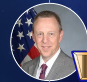
Todd Pospisil Research Center PO