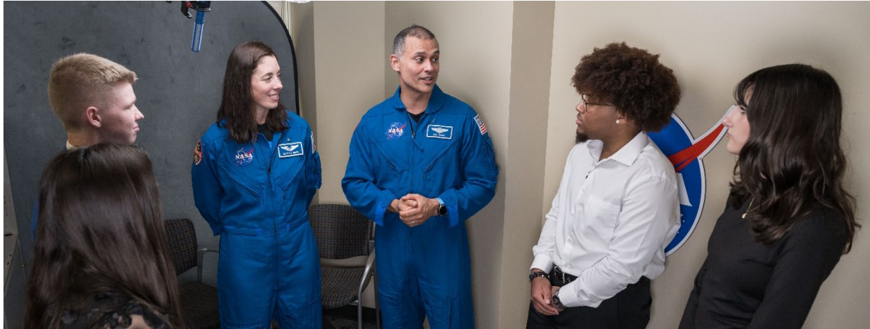
HAS alumni interviewed new astronauts Chris Birch and Anil Menon on March 5, 2024.