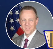
Todd Pospisil Research Center PO