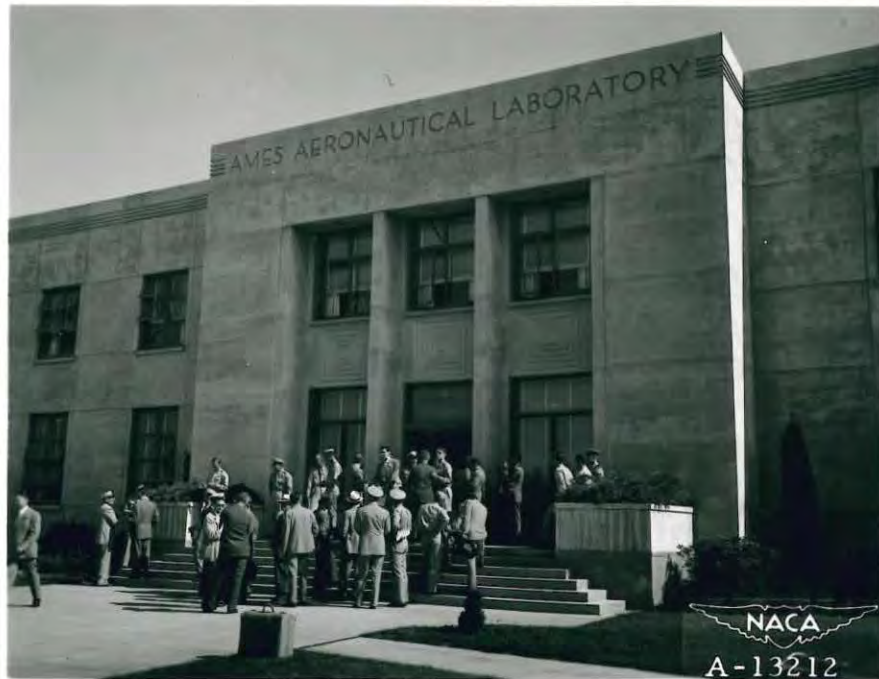
Figure 15.- The guests arrive for the 1948 Biennial Inspection of the Ames Aeronautical Laboratory.