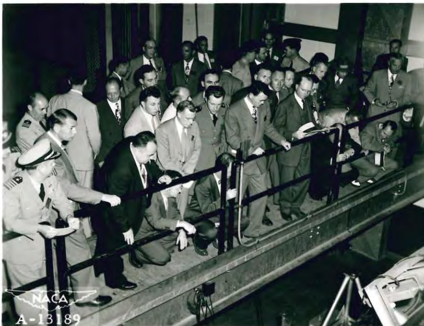
Figure 52.— A group of guests at the 16-foot high-speeds wind tunnel.