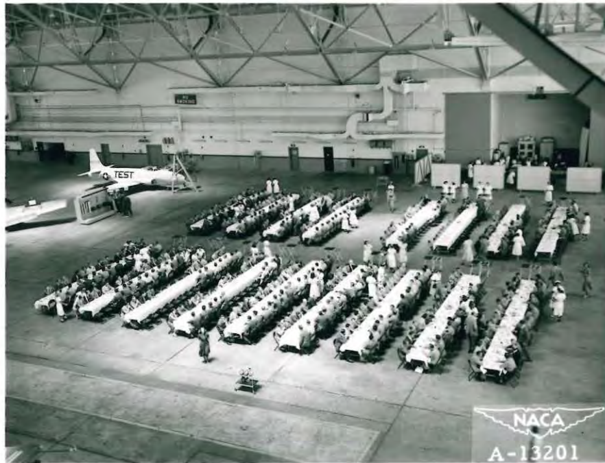
Figure 47.- Luncheon in the new hangar.