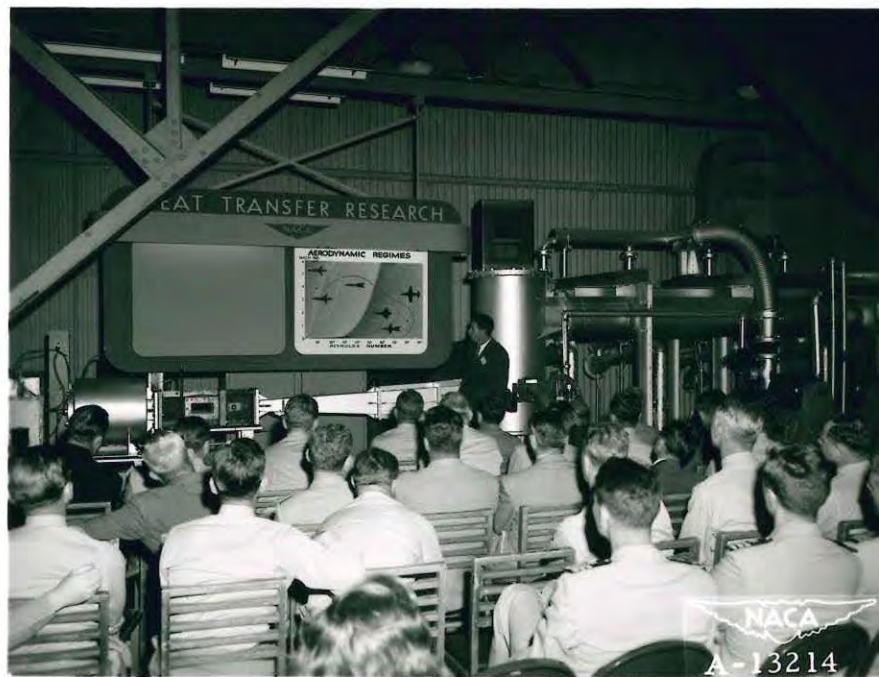
Figure 50.- The low-density wind-tunnel exhibit.