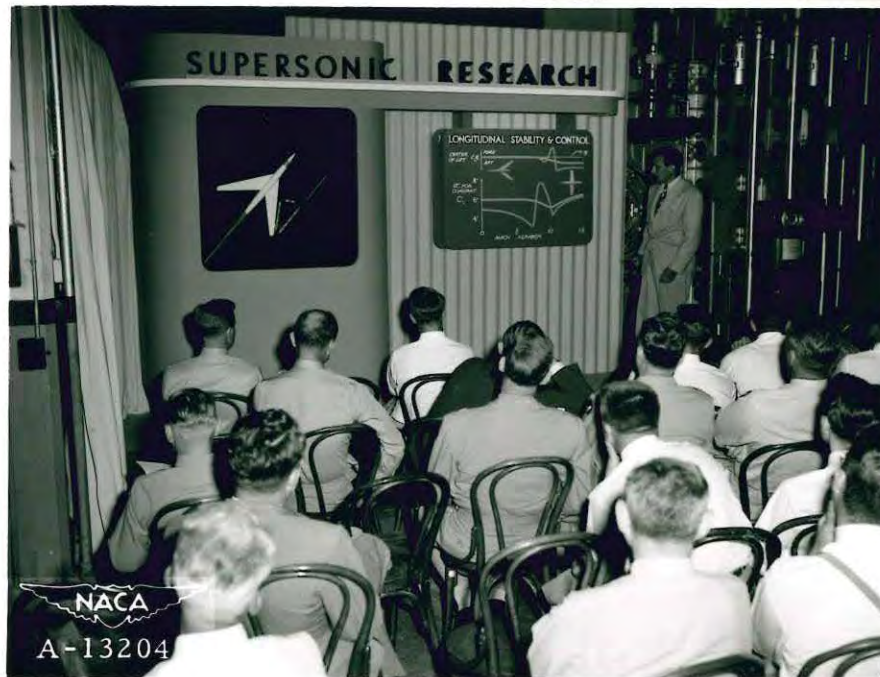
Figure 49.- The 1- by 3-foot supersonic wind-tunnel exhibit.