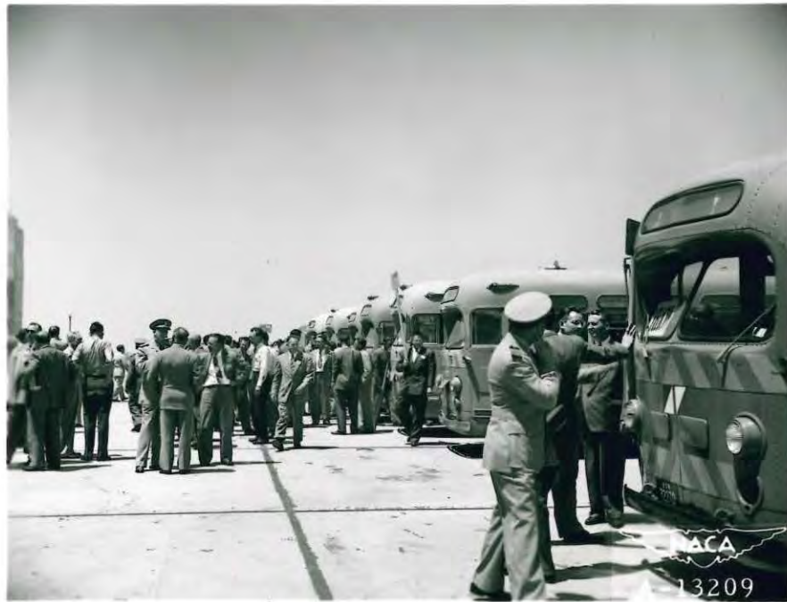
Figure 48.- The Inspection groups reassemble after lunch.