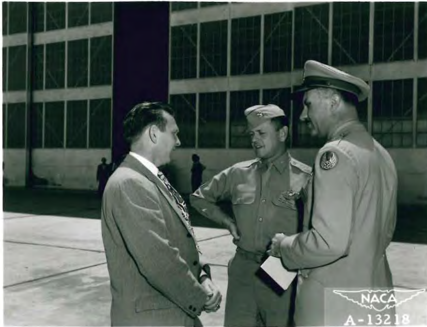
Figure 25.— H.H. Hoover, NACA, Langley Laboratory; Col. O.J. Ritland, USAF, Air Materiel Command; Brig. Gen. Donald L. Putt, USAF, USAF Headquarters.