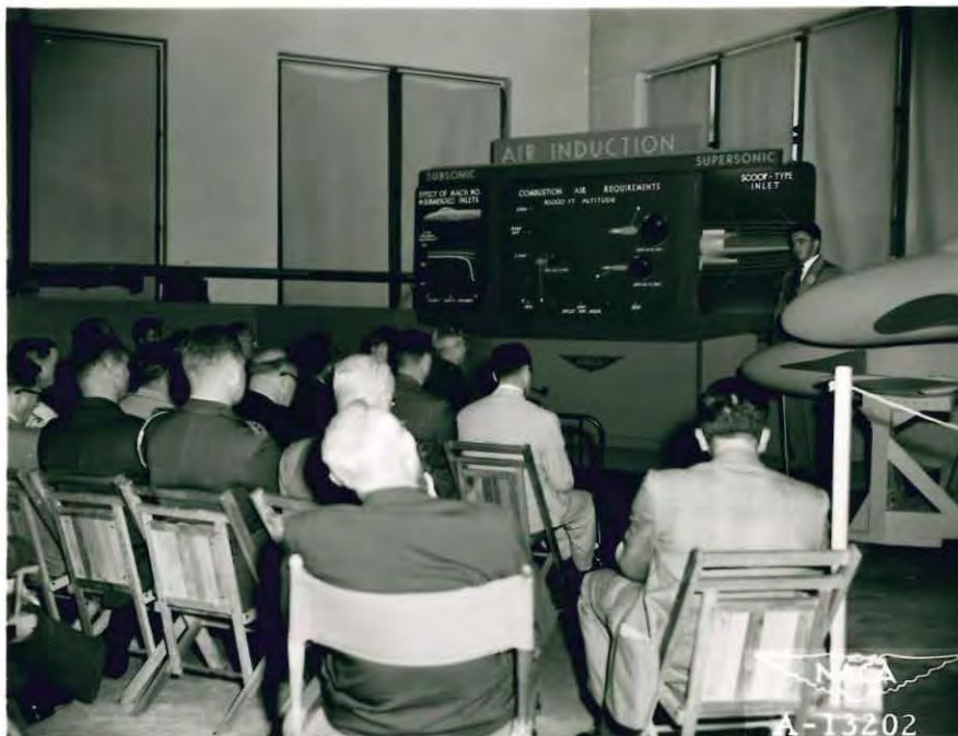
Figure 51.— The air induction exhibit.