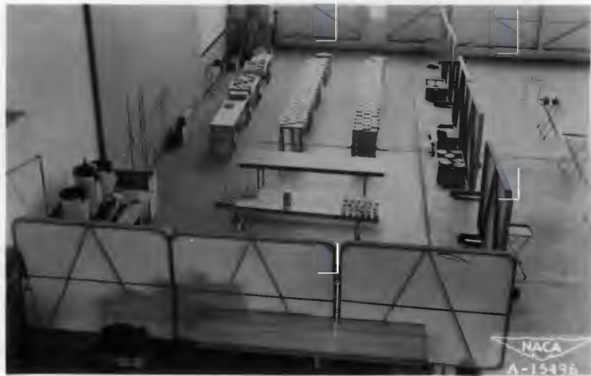
Serving Area Set Up in Hangar Number 2