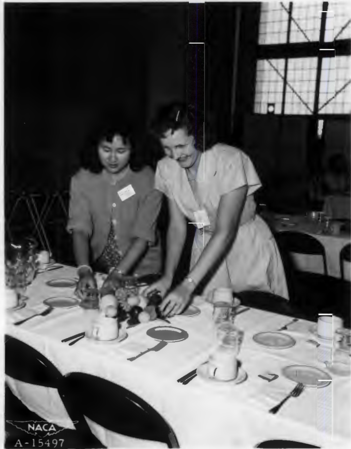
Table Center Piece