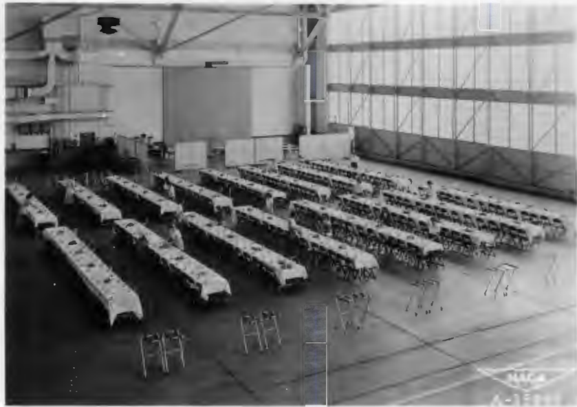
Dining Area Set Up in Hangar Number 2