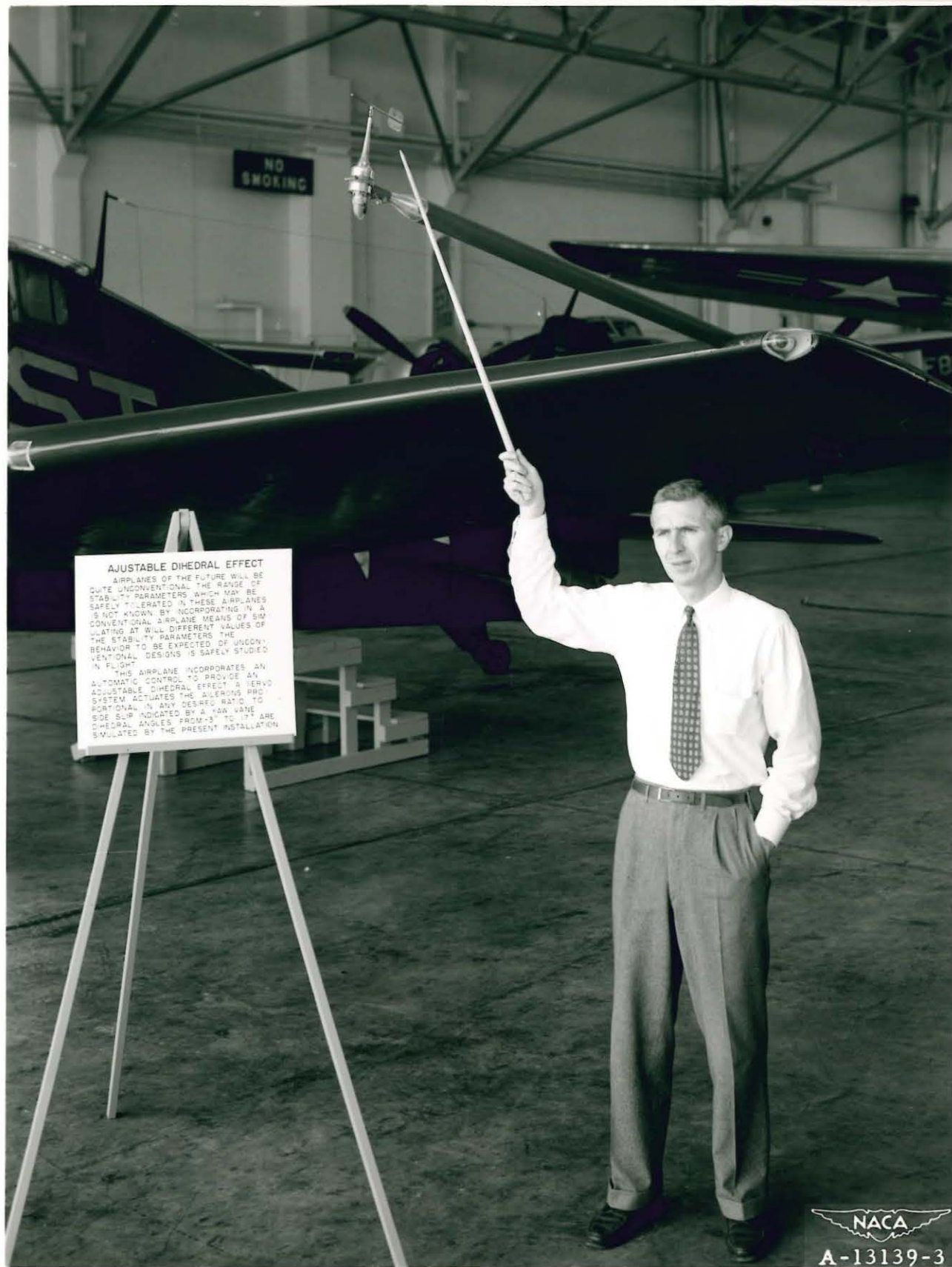
(a) Airplane equipped for investigation of dihedral effect.