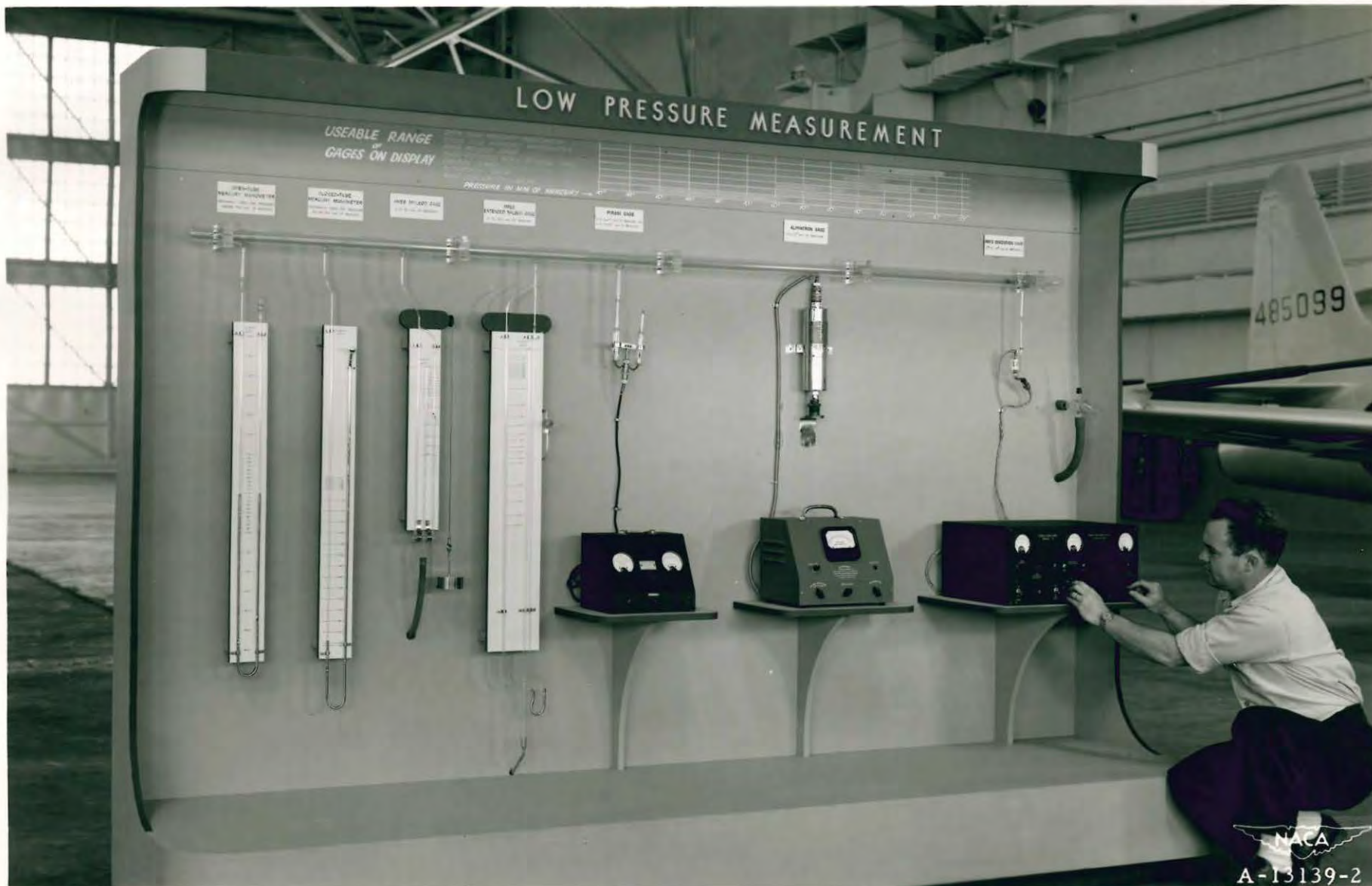
(e) Instruments for measuring low pressures.