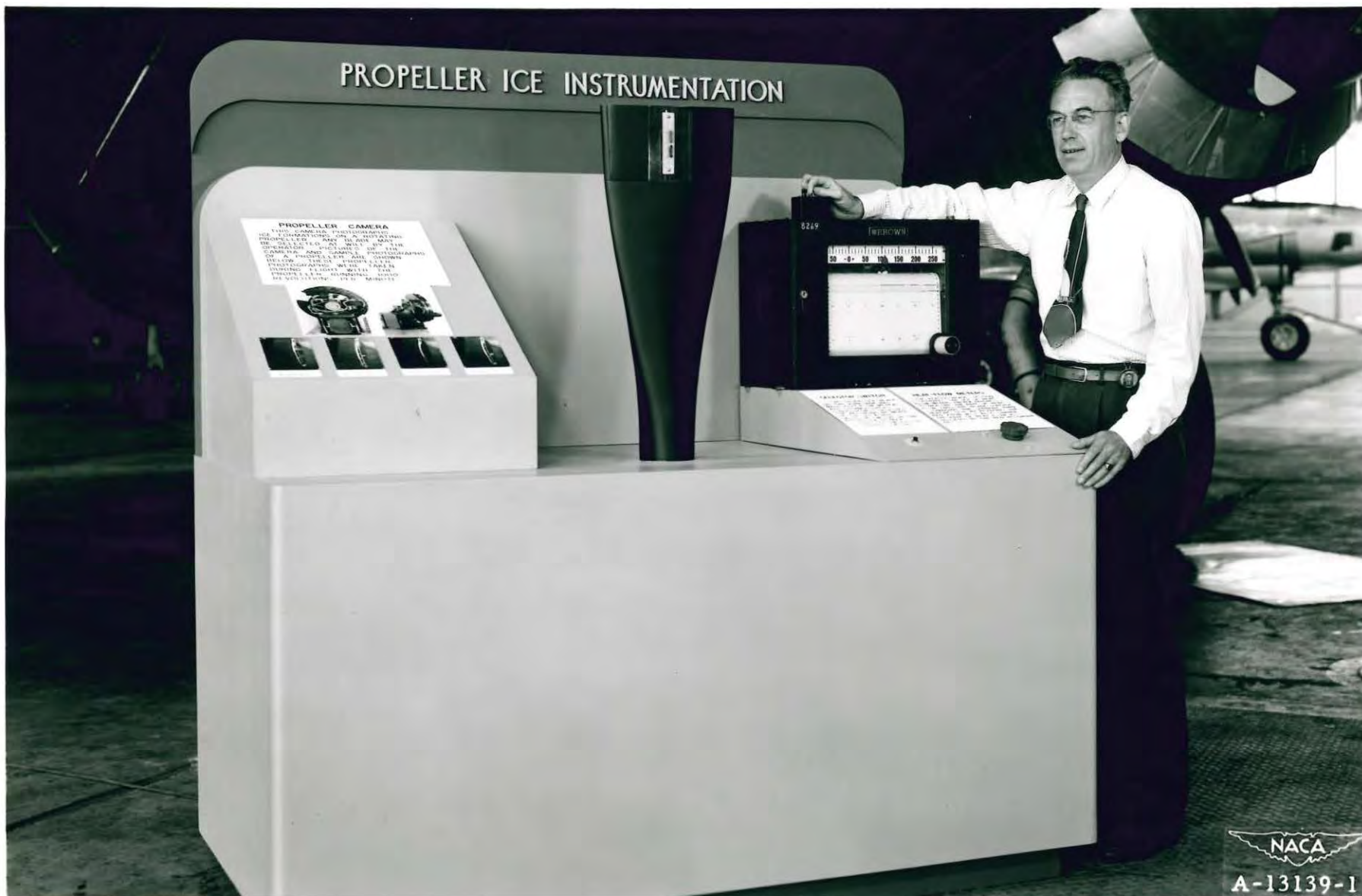
(b) Instruments used for propeller ice research.