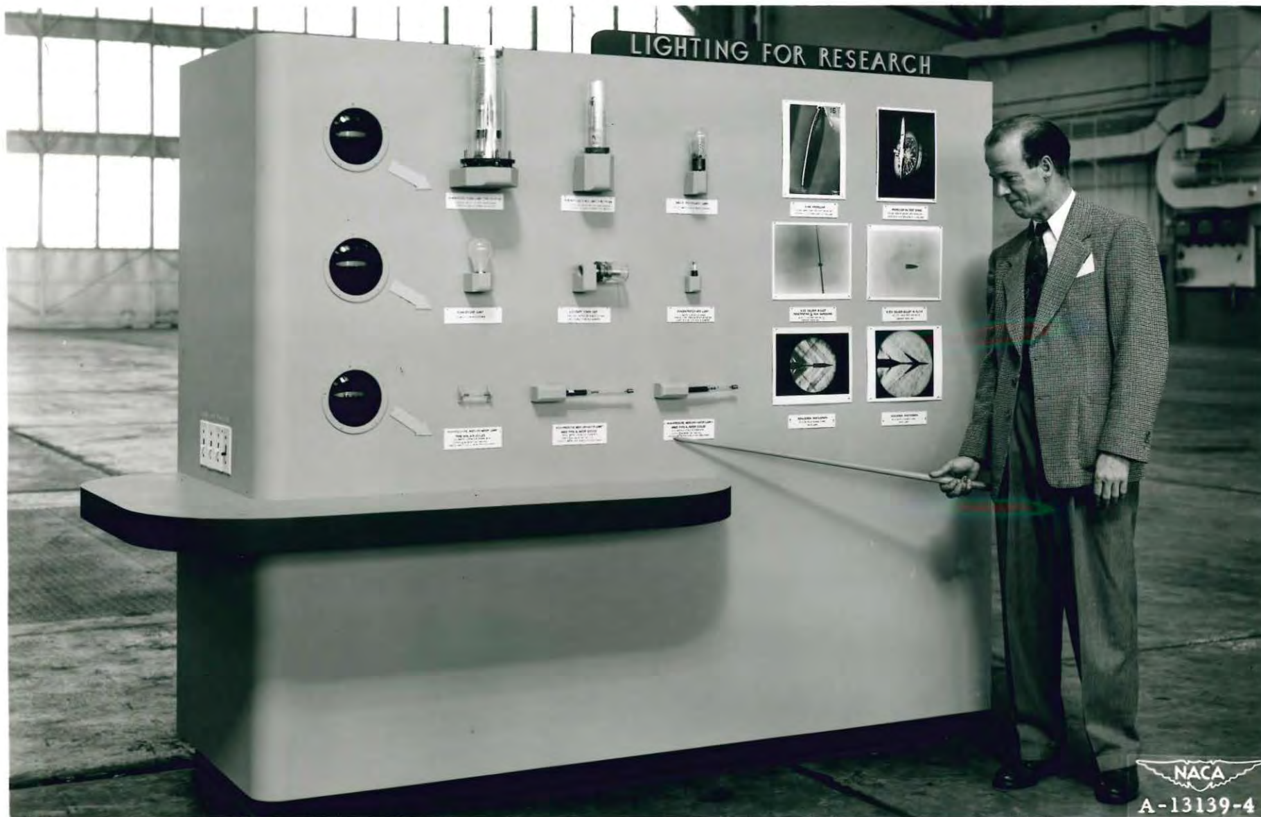
(c) Light sources for various research instruments.