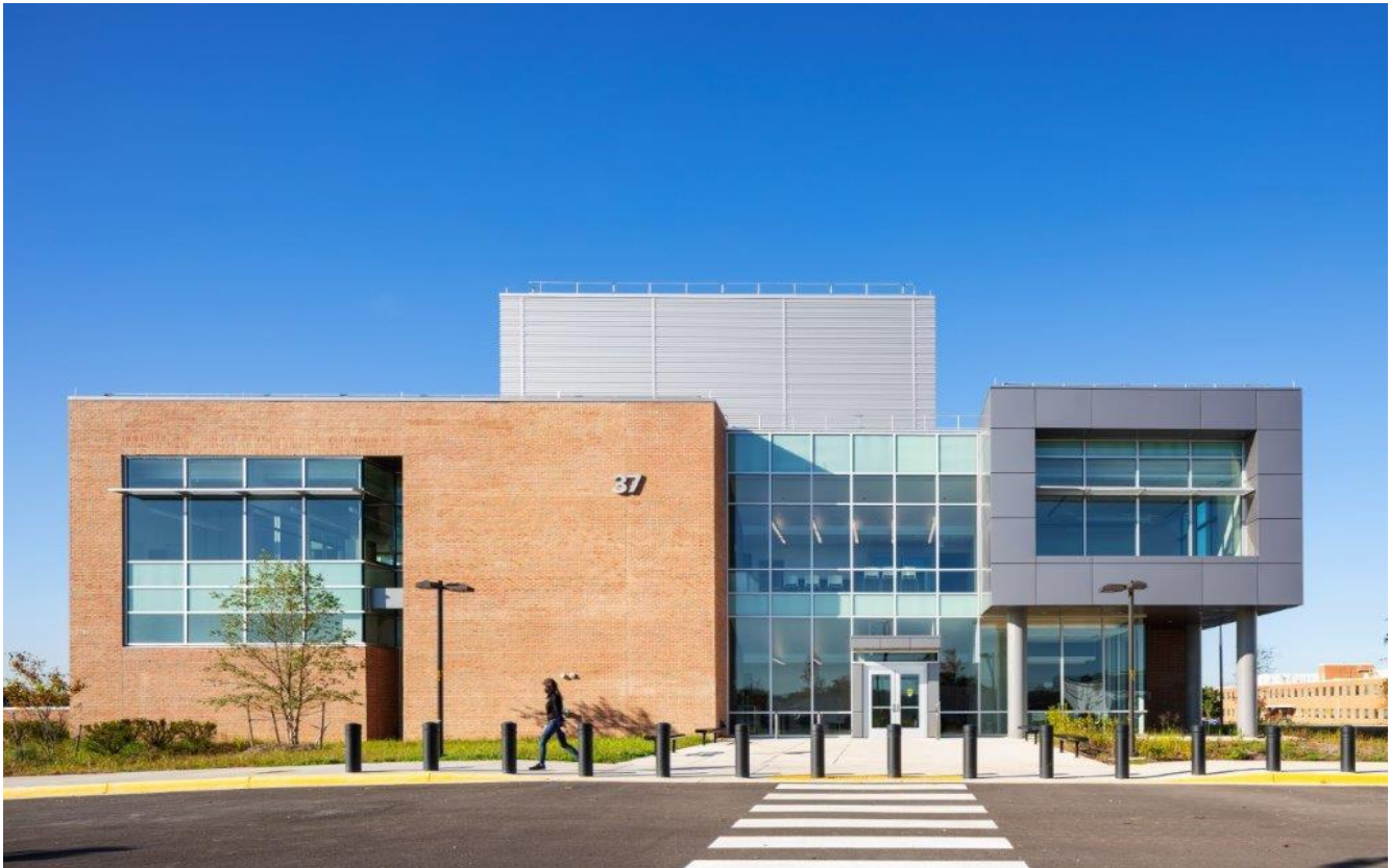
Greenbelt B37 Instrument Development Facility – 2021 Association of Builders & Contractors Excellence in Construction Award Winner