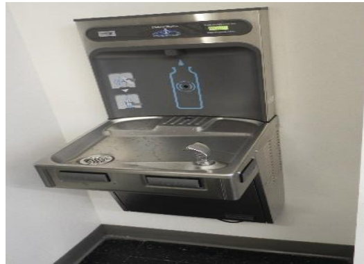
Water Bottle Filling Stations reduce waste of single use plastic water bottles

Goddard carefully manages and monitors construction projects and continues to exceed the Agency’s waste diversion goals for Construction & Demolition (C&D) debris. Goddard reaches out to employees through newsletters, signage, a recycling website, and environmental events such as America Recycle and Earth Day to provide pollution prevention awareness, but faces challenges with non-C&D solid waste diversion rates which fall below 50%.