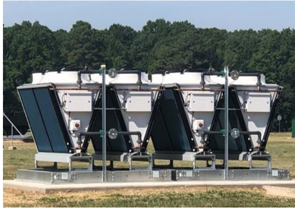
WFF E Buildings Dry Cooler