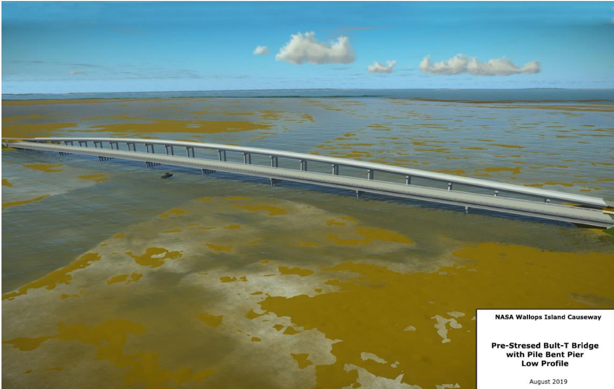
Wallops Island Causeway Bridge Replacement Envision Project