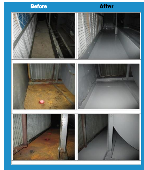
GB EBCx (Refurbishment and Coil Restoration)