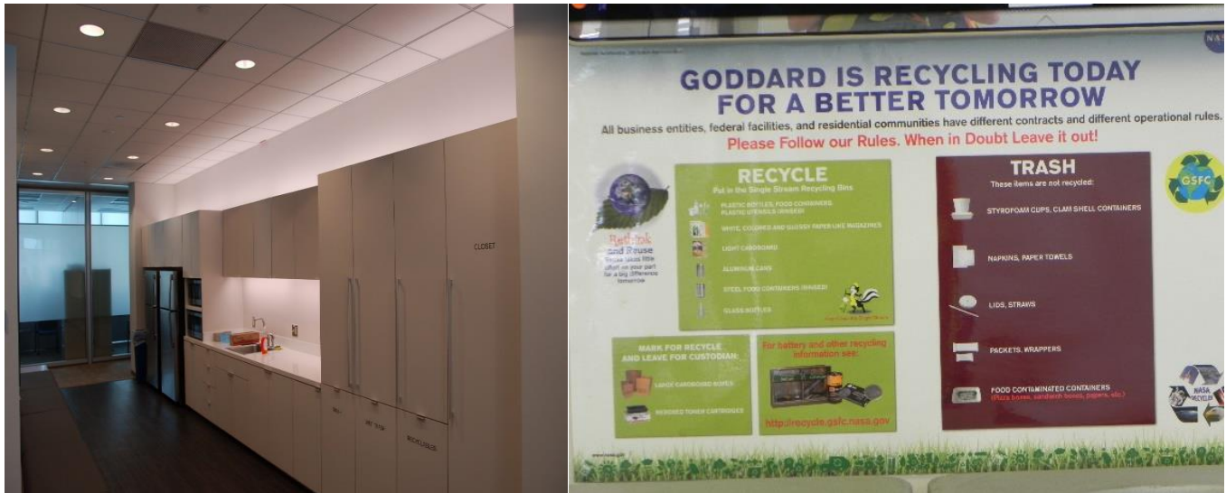
Greenbelt B26 Recycling Area and B36 Recycling Pull-Out Drawers