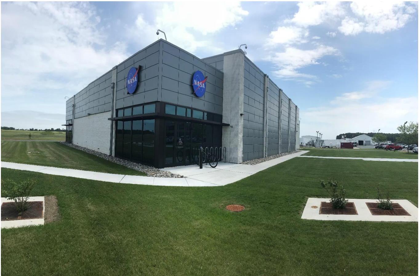
Wallops Flight Facility LEED Silver Sustainable Mission Operations Control Center (MOCC)