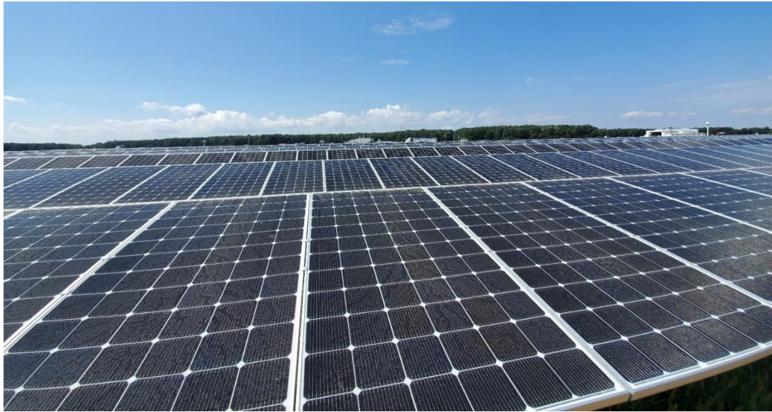
Wallops Airfield Phase 3a Photo Voltaic Panels