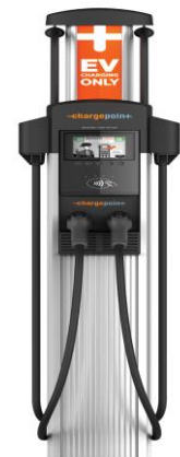
Greenbelt electric cart parking, bike sharing program bicycles, and new EV charging stations to be installed