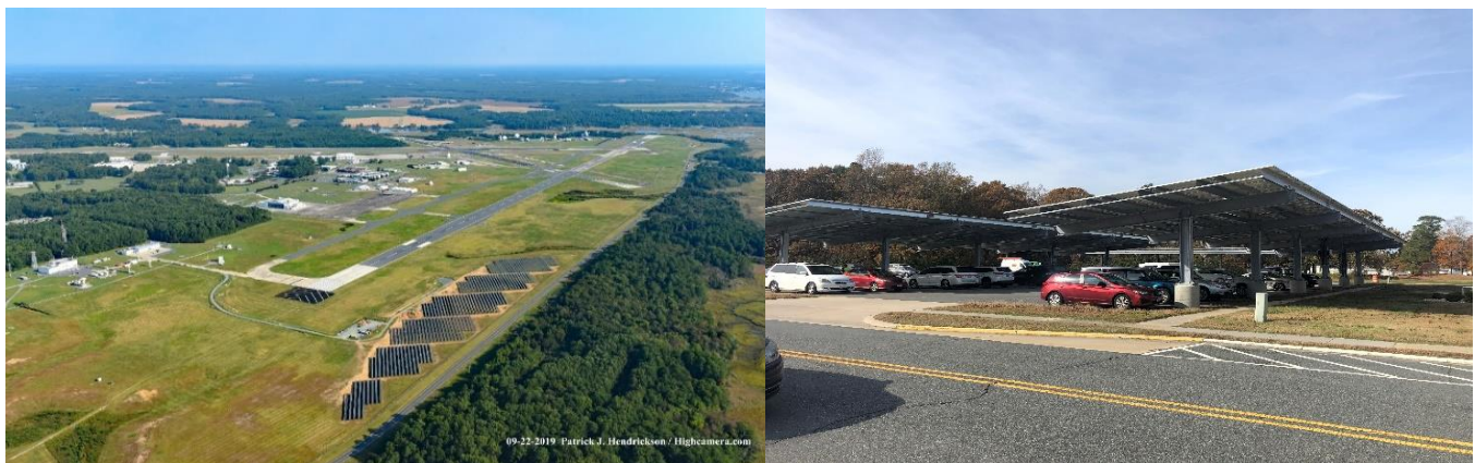
Wallops Airfield Phase 3a Photo Voltaic Panels and F6 solar parking canopies