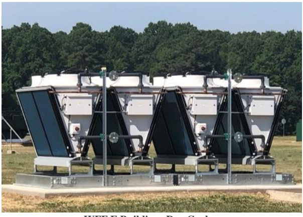
WFF E Buildings Dry Cooler