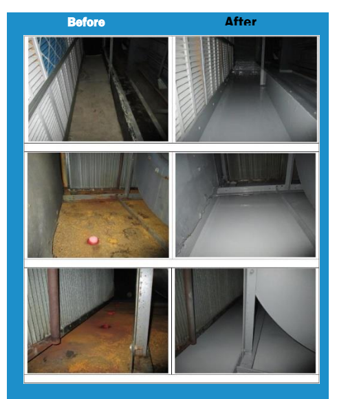
GB EBCx (Refurbishment and Coil Restoration)