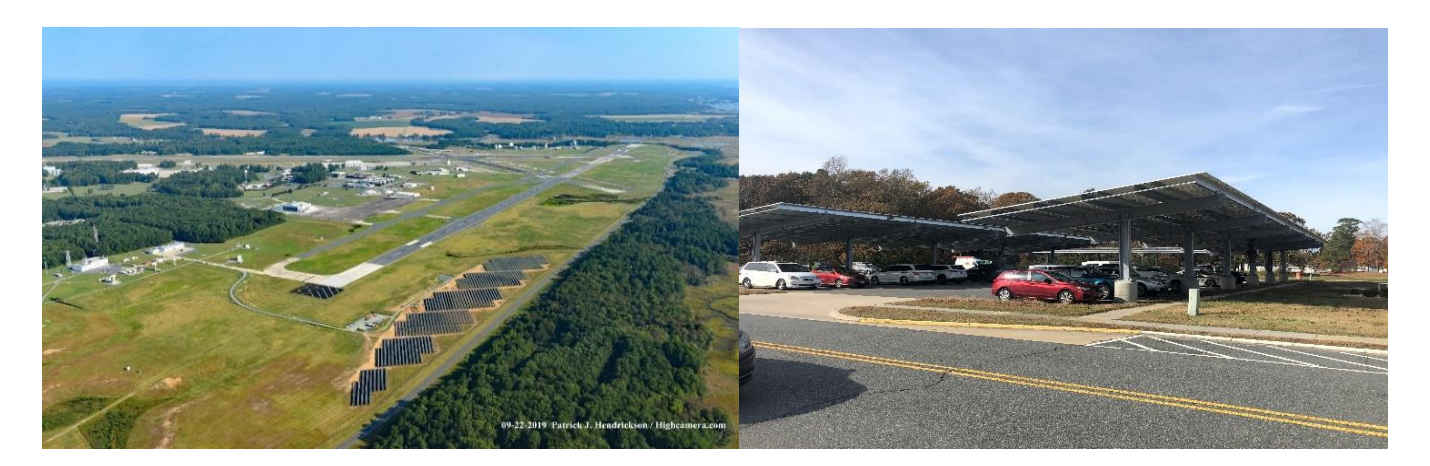
Wallops Airfield Phase 3a Photo Voltaic Panels and F6 solar parking canopies