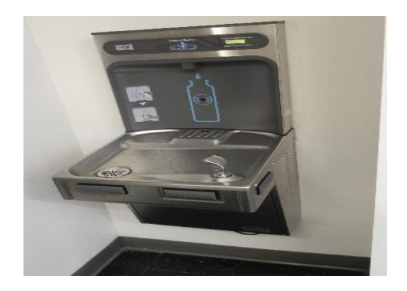
Water Bottle Filling Stations reduce waste of single use plastic water bottles

Goddard carefully manages and monitors construction projects and continues to exceed the Agency's waste diversion goals for Construction & Demolition (C&D) debris. Goddard reaches out to employees through newsletters, signage, a recycling website, and environmental events such as America Recycle and Earth Day to provide pollution prevention awareness, but faces challenges with non-C&D solid waste diversion rates which fall below 50%.