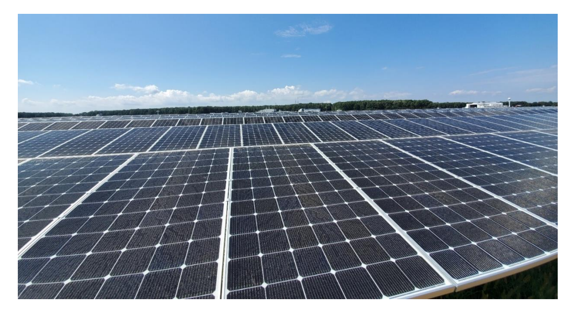
Wallops Airfield Phase 3a Photo Voltaic Panels