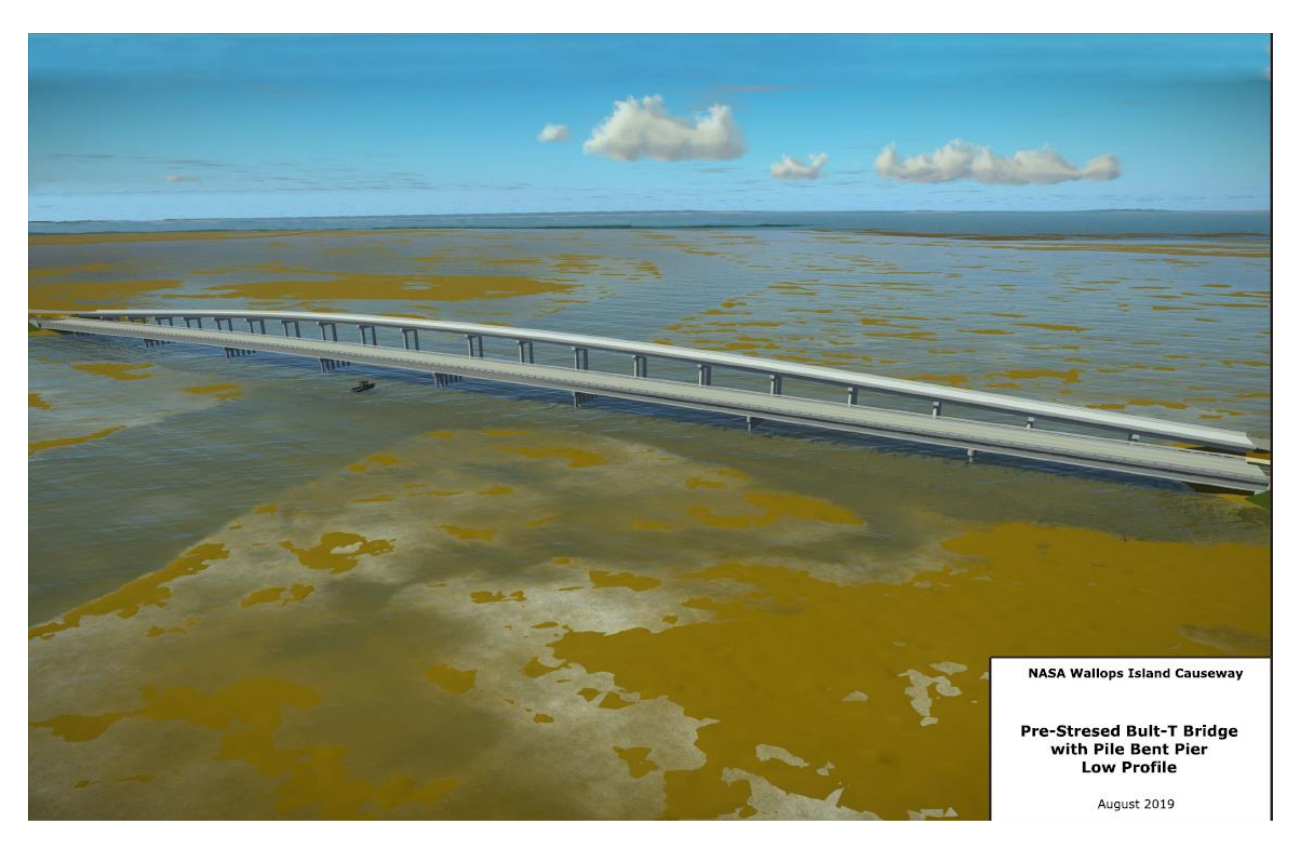
Wallops Island Causeway Bridge Replacement Envision Project