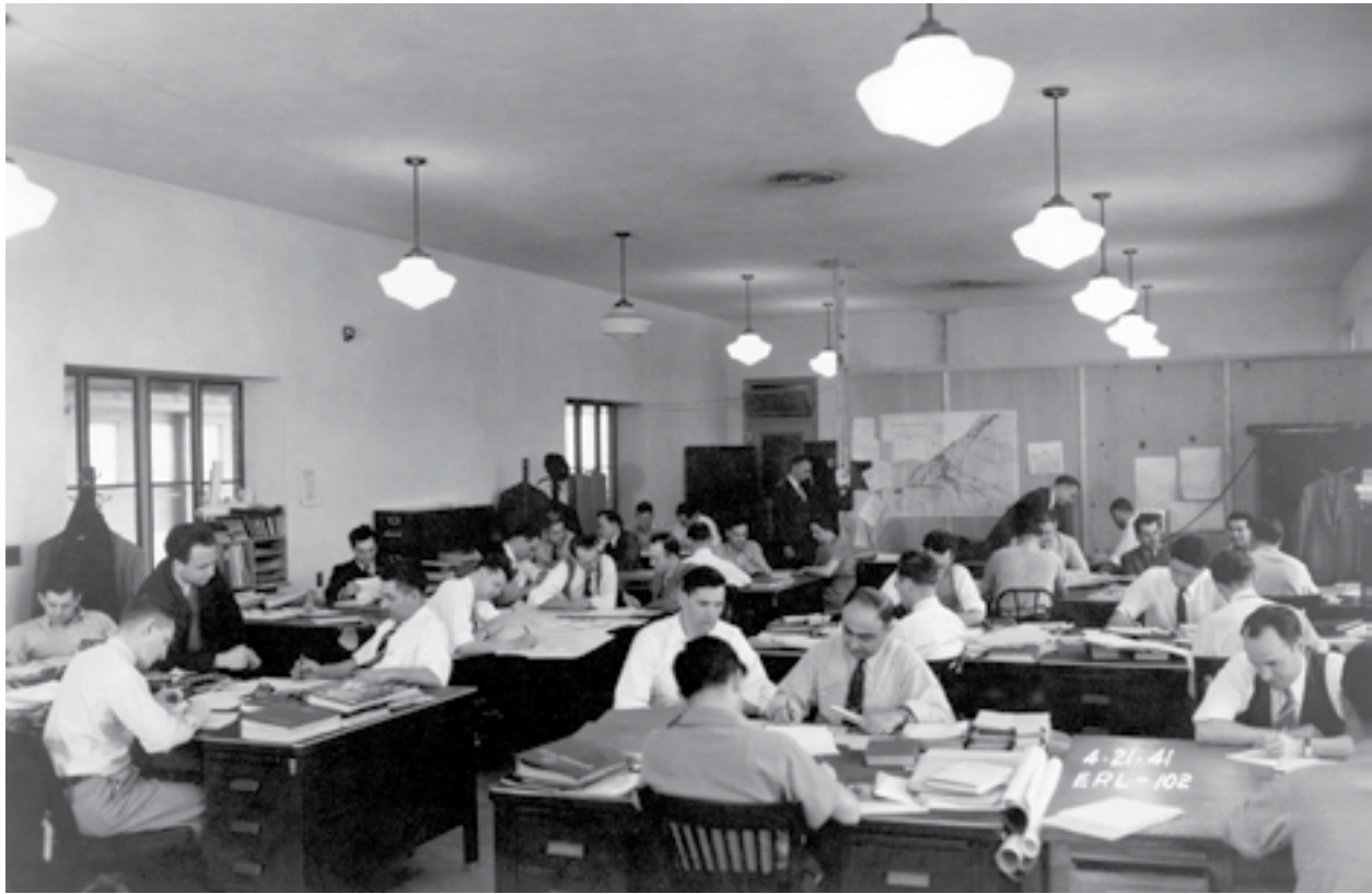
Image 24: The AERL design team works in an office above Langley's Structural Research Laboratory during April 1941 (GRC 2007-C-02563).

Meanwhile at Langley, the AERL design team was at work in an office above the Structural Research Laboratory designing the test facilities, laboratories, and offices that would soon populate the AERL site. 26 The six principal structures were the Engine Research Building, the hangar, the Fuels and Lubrication Building, the Administration Building, the Engine Propeller Research Building, and the AWT, with the Icing Research Tunnel (IRT) added in 1943.