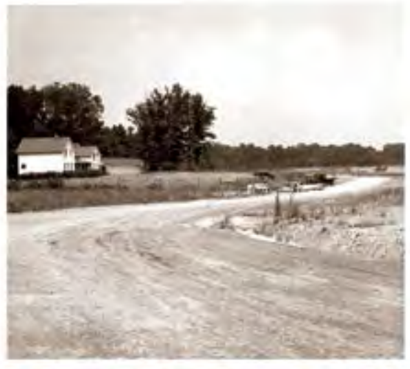
Image 25: View northward toward the lab's entrance at Brookpark Road in August 1941. The Farm House is on the left (GRC-2011-C-00350).

nation entered World War II, but the government did not wish to repeat the mistakes that it had made before World War I. The nation's failure to coordinate its ordnance manufacturing capabilities in advance of that conflict had hampered the military's effectiveness.