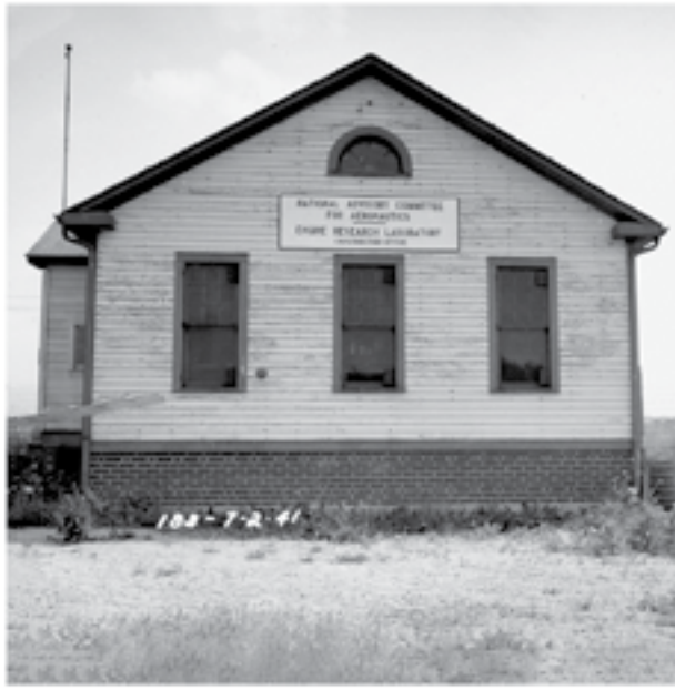
Image 23: The radio shack office was located along Brookpark Road just east of the lab's entrance, in 1942 (GRC-2011-C-00346).

"The consequences of the work done here may mean the continuance of our ability to exist." 23