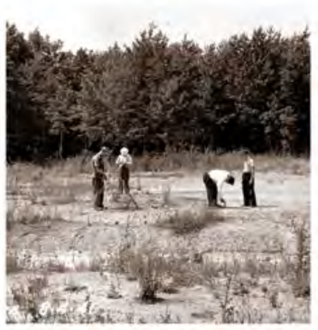
Image 21: Surveyors taking measurements for the NACA's engine lab in August 1941 (GRC-2011-C-00347). 22