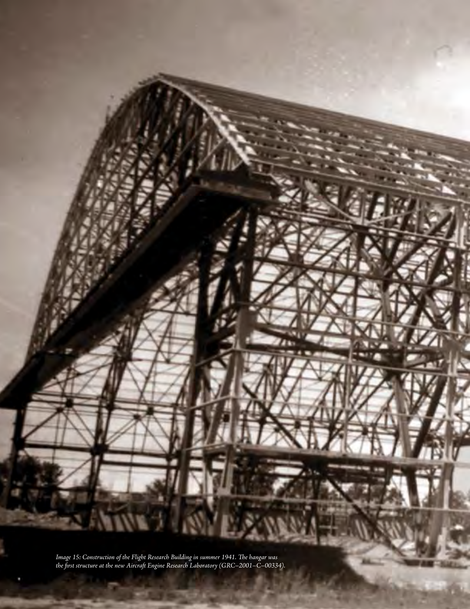
Image 15: Construction of the Flight Research Building in summer 1941. The hangar was the first structure at the new Aircraft Engine Research Laboratory (GRC-2001-C-00334).