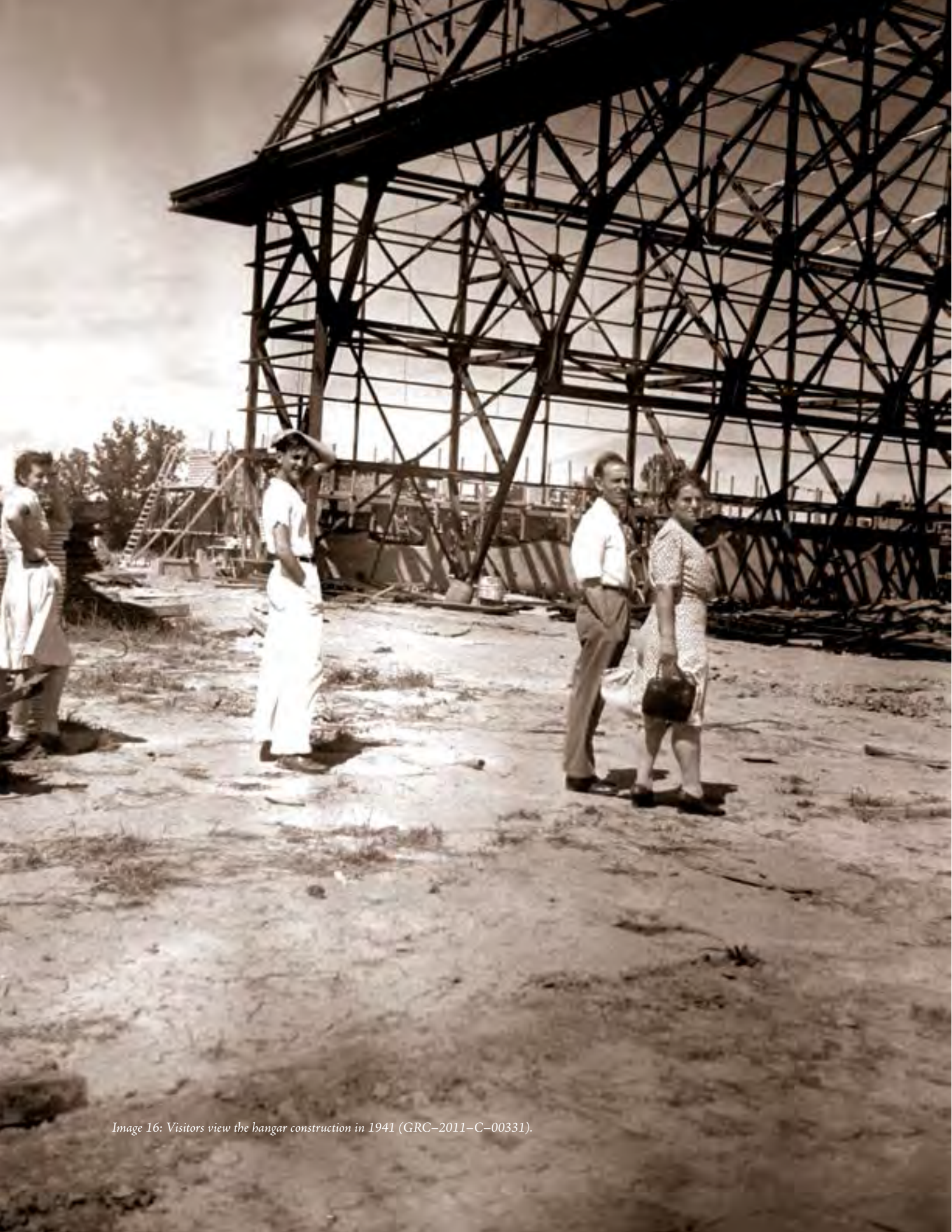
Image 16: Visitors view the hangar construction in 1941 (GRC-2011-C-00331).