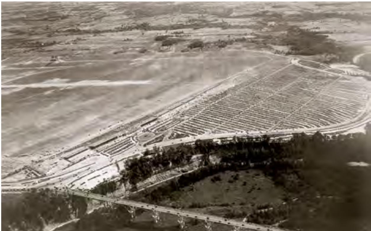
Image 19: Aerial view of the National Air Races and parking lot in September 1938 (GRC-1991-C-01875).

There were several issues standing between Cleveland and the new lab, including the location, utility rates, and the grandstands for the air races. The airport agreed to relocate the proposed site from Brookpark Road to a more secluded plot between its northern fenceline and the Rocky River valley. This site served as a parking lot for the air races. 19 Crawford assured the NACA representatives that the air races, which were not run in 1940, were permanently over, and the stands along the edge of the property would be removed. Crawford also brokered a deal in which the electric company would provide discounted rates if the lab agreed to operate its large facilities overnight when demand for electricity was low. 20 On 24 October 1940, the