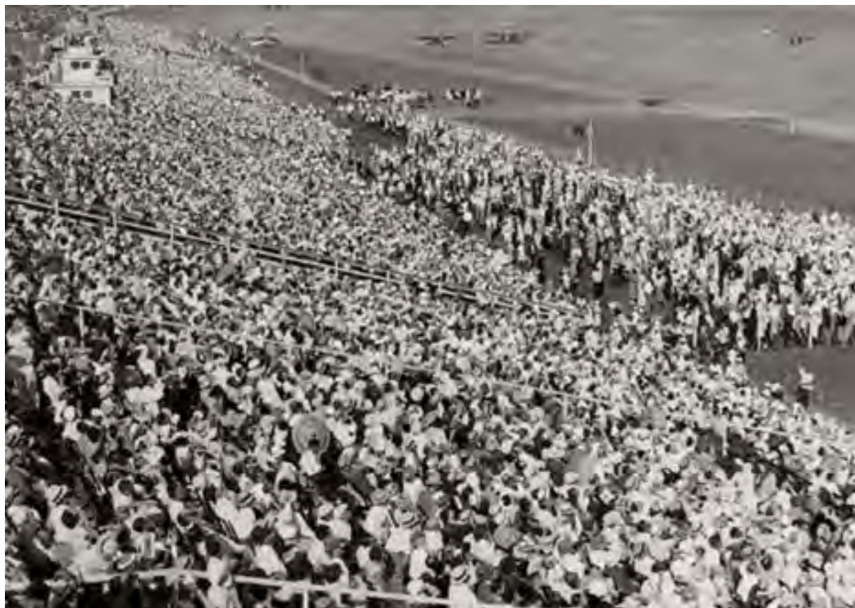
Image 17: Crowds swarm to the edge of present-day NASA Glenn to view the 1932 National Air Races. The intensely popular event was the most evident sign of Cleveland's ties to aviation, but the city also possessed a strong aircraft manufacturing industry and the nation's largest and most innovative airport (The Cleveland Press Collection, Michael Schwartz Library, Cleveland State University).

Congress established the National Advisory Committee for Aeronautics (NACA) in 1915 to coordinate the nation's aeronautical research, which at the onset of World War I, seriously lagged behind its European counterparts. 4 The 12-member committee, composed of representatives from the military, industry, and other institutions, initially supported the military and aircraft industry in a purely advisory capacity. In 1917 the committee began constructing the Langley Memorial Aeronautical Laboratory in Virginia in order to conduct research of its own. Langley built a series of increasingly advanced wind tunnels during the ensuing years to support the research activities. George W. Lewis, the NACA's Director of Aeronautical Research, served as a liaison between the committee and the lab. By the mid-1930s NACA advances such as its eponymous engine cowling and collection of