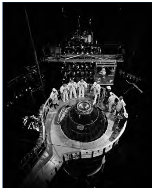
High-angle interior view of Chamber A showing three astronauts preparing to enter the Block II Thermal Vacuum Test Article in 1969. (Image Number S68-37430)

Compliance with the National Historic Preservation Act (NHPA) is required when projects, called