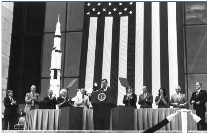
President George H. W. Bush announces his Space Exploration Initiative plan on 20 July 1989, the 20th anniversary of the Apollo 11 lunar landing. (Image Number 89-H-380)