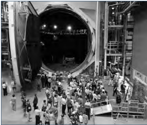
JSC open house, 2005. Overall view of visitors listening to Heather Paul and Amy Ross at the spacesuits exhibit in Building 32, with Chamber A's 40-foot door open in the background. (Image Number jsc2005e16878)

Since it was constructed in 1965, the SESL has tested all Apollo command and service modules, Apollo lunar modules, space suits for extra-vehicular activity, the Skylab/Apollo telescope mount system, various Space Shuttle systems, the Apollo/Soyuz docking module, many assembled-in-orbit components of the International Space Station, and various large scale scientific satellite systems such as the parabolic reflector subsystem of the Applications Technology Satellite. The thermal vacuum testing done at the SESL since 1965 has been a significant factor contributing to the success of both the manned and unmanned space program of the United States.