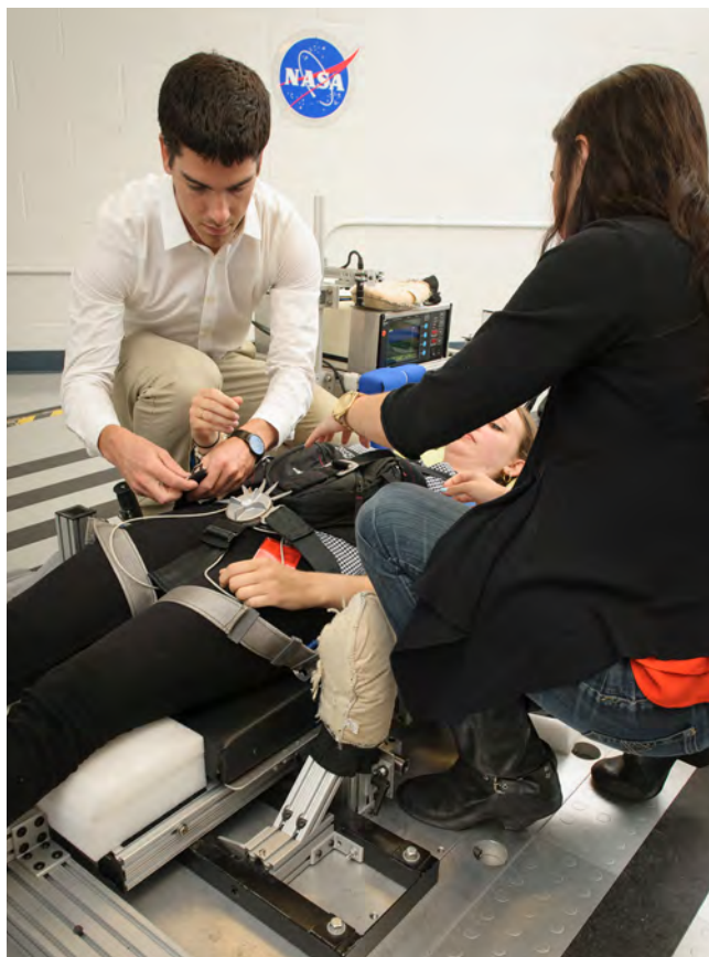
2013 SLSTP students performing research using the Human Performance Centrifuge at Ames

The SLSTP is funded by NASA's Science Mission Directorate. The SLSTP is managed by the Space Biology Project within the Science Directorate at Ames Research Center.