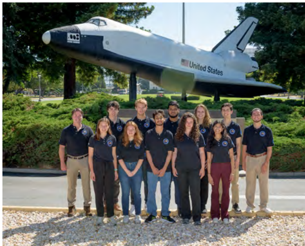
2023 SLSTP participants at Ames.

In this rigorous program, students work closely with renowned NASA scientists and engineers on cutting-edge research, benefiting from the concentration of bioscience expertise at Ames. In addition to conducting hands-on research, SLSTP students attend technical lectures given by experts on a wide range of topics and tour NASA research facilities.