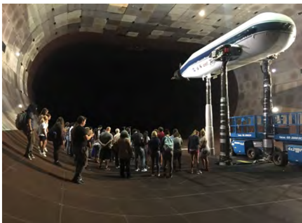
2018 SLSTP participants at Ames getting a tour of the largest wind tunnel in operation.

SLSTP participants are exposed to a broad scope of bioscience research performed by NASA scientists. Participants acquire skills and knowledge of the tools and methodology used by NASA to conduct life science experiments in space.