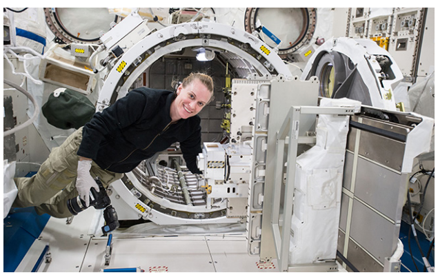
Astronaut Kate Rubins loading the Robotic External Leak Locator for deployment into space.

leaks on the ammonia cooling loop. Astronauts have undertaken spacewalks to help diagnose, troubleshoot and replace components within the complex active thermal control system. Without a way to robotically locate leaks with high accuracy, astronauts have used spacewalk time to inspect and isolate a potential leak site before addressing the problem at hand.