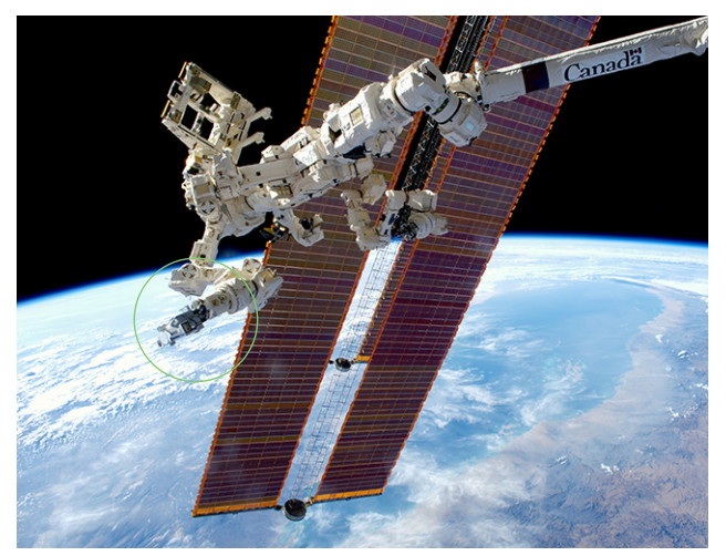
The Robotic External Leak Locator on the end of the Dextre robot in February 2017.

National Aeronautics and Space Administration