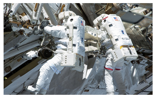
NASA astronauts during a May 2013 leak repair spacewalk.

Just as coolant in your car is used to cool its engine, ammonia is circulated through a huge system of pumps, reservoirs and radiators on the space station to cool all of its complex life support systems, spacecraft equipment and science experiments. This coolant system contains thousands of feet of tubing and hundreds of joints. Throughout its lifetime, this system has experienced tens of thousands of thermal cycles orbiting through night and day and the normal wear and tear that comes with over a decade in service. The space station also has to contend with micrometeoroids: tiny objects whizzing through space at speeds that can easily exceed 20,000 miles per hour – and that can cause unwanted, microscopic holes in spacecraft equipment.