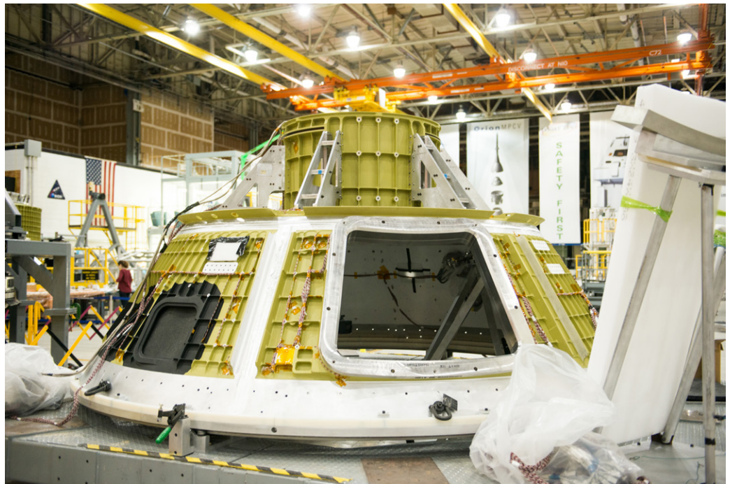
Seven Oregon suppliers contributed to NASA's Artemis program. An example of the state's contributions is the supply of different electronic components like fiber channel connectors and switches for Orion.