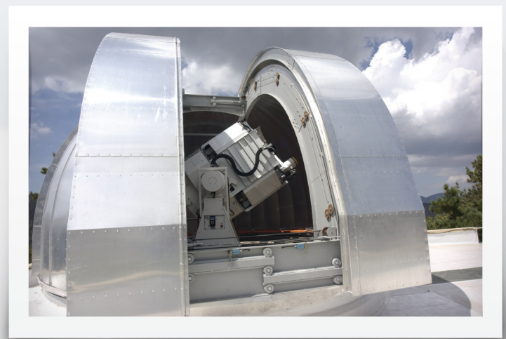
LCRD will communicate with optical ground stations at Table Mountain, California, and Haleakala, Hawaii. The Table Mountain station, seen above, is managed and operated by NASA's Jet Propulsion Laboratory in Pasadena, California.

Hawaii, which were chosen for their minimal cloud coverage. Unlike radio waves, laser signals cannot penetrate cloud coverage so NASA must build a system flexible enough to avoid weather interruptions. LCRD will test different cloud coverage scenarios, gathering valuable information about the flexibility of laser communications.