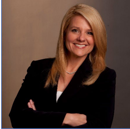
Ms. Gwynne Shotwell President and COO, SpaceX

SpaceX is a leading global commercial space launch, space transportation, and telecommunications services company. SpaceX has successfully conducted more than 200 launches to space for NASA, DOD, and commercial companies, including 8 crewed missions to orbit for NASA and private individuals since 2020. SpaceX operates the Starlink high-speed, low-latency satellite broadband system providing global coverage to more than 1 million households across all 7 continents with more than 3,500 satellites in orbit today and thousands more slated for launch in the near future.