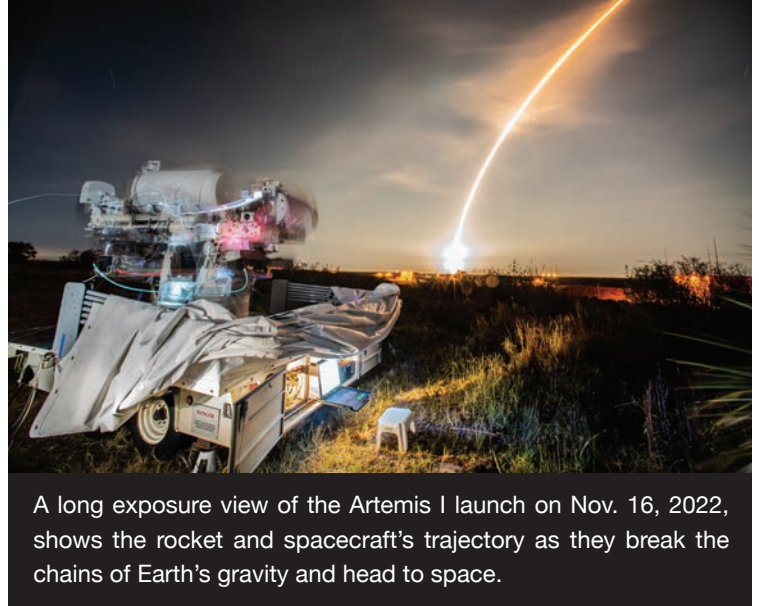
A long exposure view of the Artemis I launch on Nov. 16, 2022, shows the rocket and spacecraft's trajectory as they break the chains of Earth's gravity and head to space.