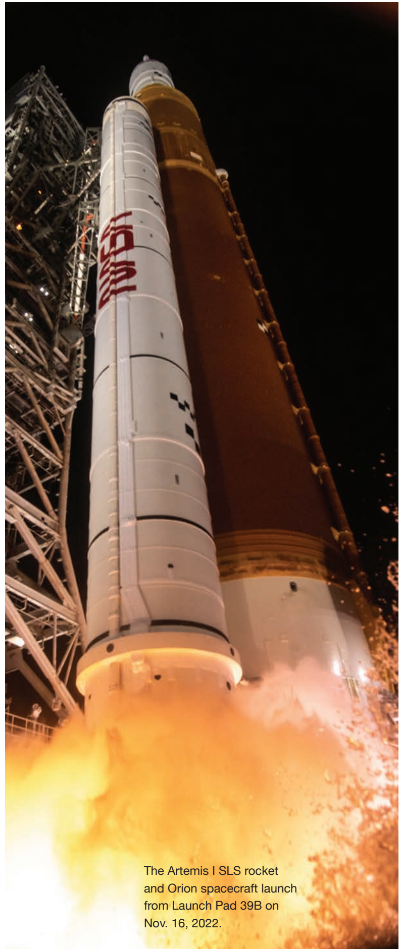
The Artemis I SLS rocket and Orion spacecraft launch from Launch Pad 39B on Nov. 16, 2022.