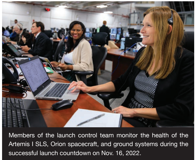
Members of the launch control team monitor the health of the Artemis I SLS, Orion spacecraft, and ground systems during the successful launch countdown on Nov. 16, 2022.

Following a successful launch of SLS, the agency's Orion spacecraft was on its way to the Moon as part of the Artemis program. Carrying an uncrewed Orion, SLS lifted off for its flight test debut at 1:47 a.m. EST Wednesday, Nov. 16 from Launch Pad 39B at NASA's Kennedy Space Center in Florida. The launch was the first leg of a mission in which Orion traveled approximately 40,000 miles beyond the Moon and returned to Earth over the course of 25.5 days. Known as Artemis I , the mission was a critical part of NASA's Moon to Mars exploration approach, in which the agency explores for the benefit of humanity. It was an important test for the agency before flying astronauts on the Artemis II mission.