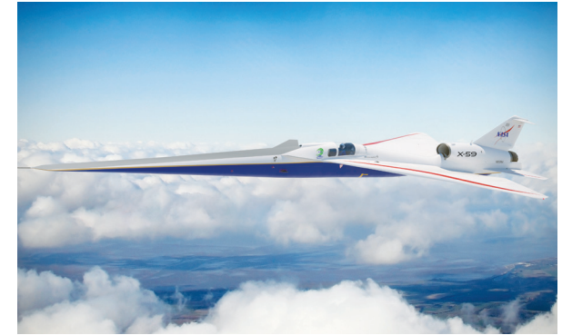
An artist illustration of NASA's X-59 in flight over land with cities and rural areas below. When the X-59 enters its community testing phase, it will fly over several U.S. cities to gather data on how effective the technology is in terms of public acceptance. Credit: Lockheed Martin

Through a series of flight tests, NASA and Lockheed Martin will work together to prove the X-59 performs as designed and is safe to fly in the U.S. airspace system. After these tests, NASA will conduct a series of validation flights to demonstrate the quiet supersonic technology works and sonic thumps are heard on the ground as expected.