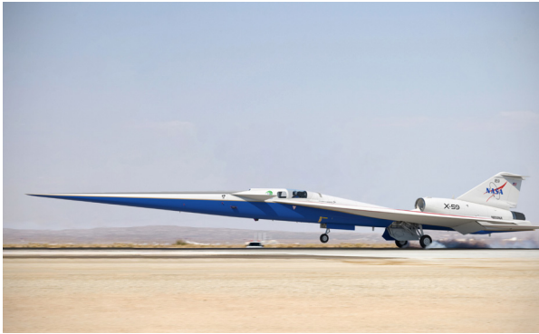
Artist illustration of the X-59 taking off from a runway close to where the airplane is being assembled and tested at Lockheed Martin's Skunk Works facility in Palmdale, California.