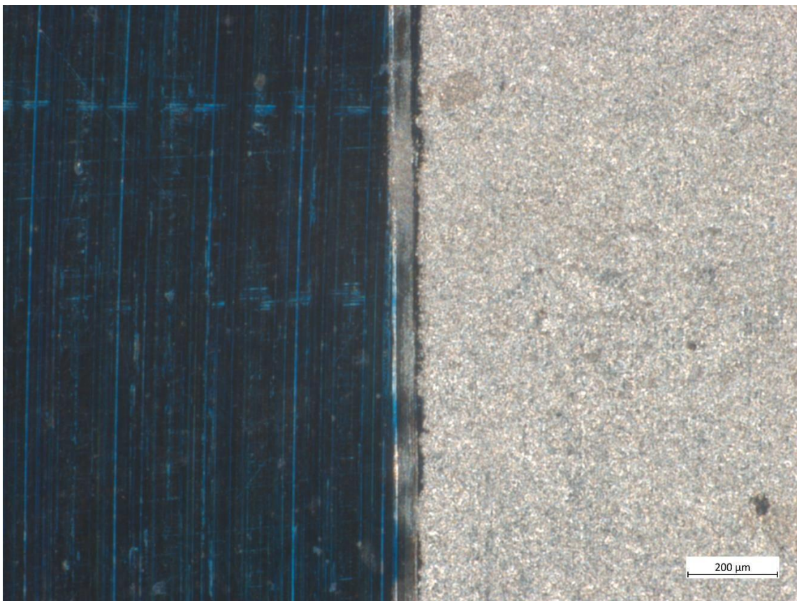
Figure 4: Ti 6-4 discoloration (alpha case) post heat treating in air at 1100F for 2hrs (left). Ti 6-4 surface post alpha case removal using 30% nitric acid, 3% hydrofluoric acid and 67% H2O solution (right).