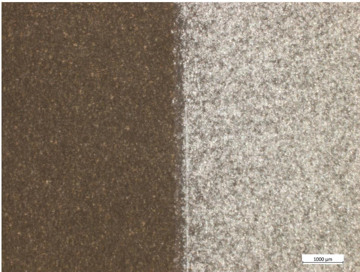
Figure 3: CRES 304 wire EDM surface (left), descaled surface (right).