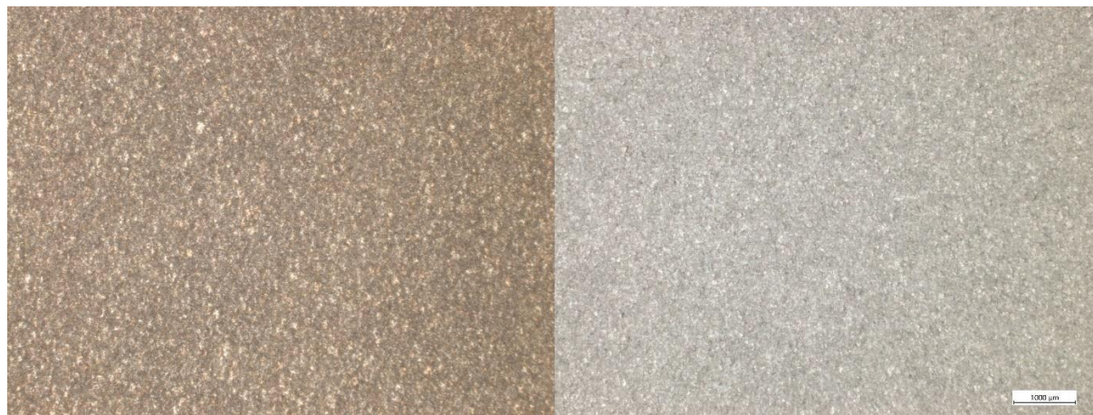
Figure 3: Ti 6-4 wire EDM surface (left), descaled surface (right).