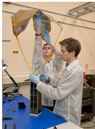
Engineers pack TechEdSat-5 with Exo-Brake payload.

The TechEdSat mission is supported by the Ames Engineering Directorate, the Ames Safety and Mission Assurance Directorate, and the Ames Chief Technologist Office Center Innovation Fund. Both TechEdSat and the Exo-Brake are funded by the Entry Systems Modeling project within the Space Technology Mission Directorate's Game Changing Development program and the NASA Engineering and Safety Center.