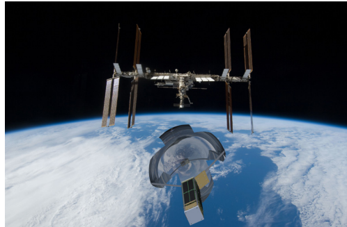
Illustration of TechEdSat-5 post-jettison from the International Space Station.

TechEdSat-6, with the updated Exo-Brake and Modulation control, sets the stage for even more accurate de-orbit and the automation planned for future TES flights.