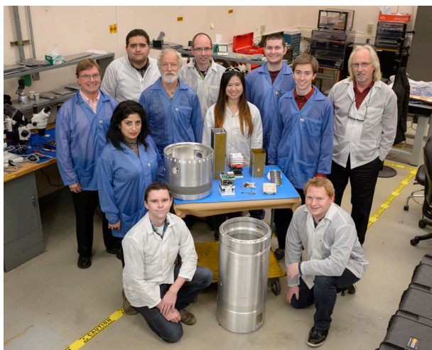
The TechEdSat team at NASA Ames Research Center.

TES-4 further developed the capability of the Exo-Brake de-orbiting system and laid the groundwork for controlling the Exo-Brake in orbit. TES-4's demonstration of a satellite-to-satellite communications system allowed for more frequent communication with the satellite, leading to more accurate satellite altitude and position predictions, which are important for the optimal operation of the Exo-Brake. The satellite's structure, avionics and payload were custom-designed by the TES-4 team to utilize its 3U volume. The TES-4 hardware consisted mostly of off-the-shelf components, allowing for easily reproducible future flight variations.