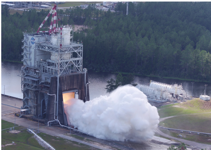
RS-25 rocket engine hot fire test at NASA's Stennis Space Center

The next planned evolution of the SLS, Block 1B, would use a more powerful Exploration Upper Stage (EUS) to enable more ambitious missions, and a 38 t (83,776 lbs.) lift capacity to the Moon.