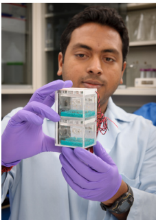
The first flight experiment to use the Compact Science Experiment Module aboard the space station was designed and built by students at Ames.

Biospecimens extracted from the Cassettes in the spent food trays can be preserved aboard the station for post-flight analysis. The system was flown on the shuttle middeck on STS-121 in 2006 and to the station in 2015 for the Fruit Fly Lab-01 mission. This system also can interface with various existing environmental chambers, centrifuge systems, and video and lighting systems that have been developed by commercial providers. Such facilities can provide additional capabilities of variable gravity levels, environmental controls and imaging during spaceflight.