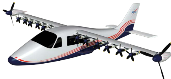
Figure 1. NASA's X-57 is powered completely by batteries in order to reduce harmful emissions.

NASA is always working to make flight safer, more convenient and more environmentally friendly. Airplanes powered by electricity rather than by burning fuel produce much fewer harmful emissions, which helps protect the environment. This type of propulsion is known as electrified aircraft propulsion.