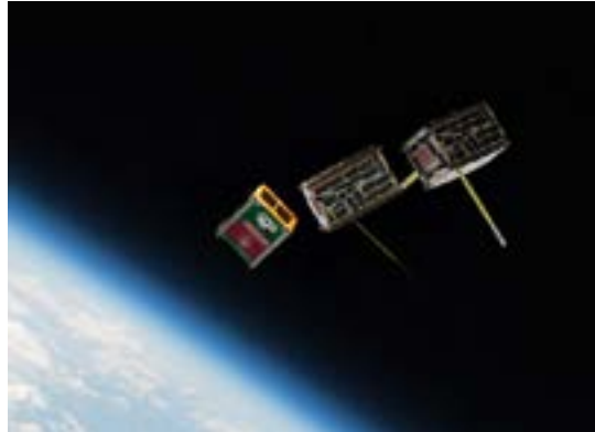
Nodes spacecraft deployed into low Earth orbit

Each satellite was equipped with three radios: one S-band radio for ground