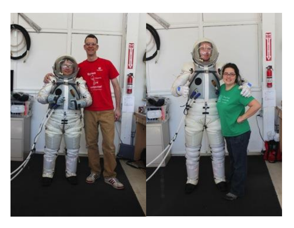
Figure 1. FFD's IVA Space Suit, +3 PSIG, Illustrating a 14" vertical adjustment range

FFD knows there is a significant market need for a new generation, lighter weight, inexpensive, and reliable IVA space suit, for both NASA and private entities alike. Competition in the space safety garment market will drive down costs for manned space flight considerably; the current market options are very limited, relying mostly on heritage gear from military applications dating back to the 1960's. Development of advanced space safety gear fits squarely in NASA's long term strategic goals.