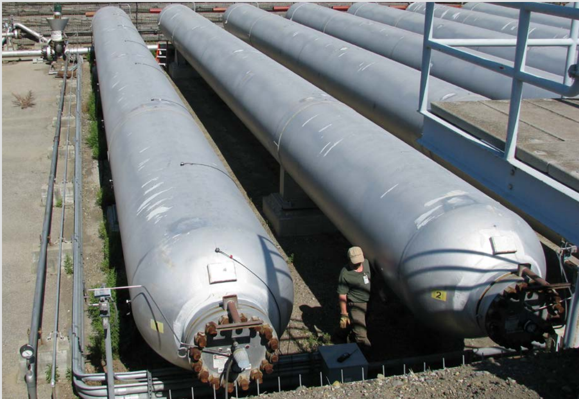
Typical large facility layered pressure vessels can be pressurized to 5,000 psi.

The assessment began with reviewing any available inventory information, like manufacturer, age, condition, rated and operating pressure, contents, layer thickness,