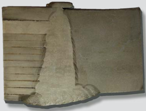
Section of weld between layered tank cylinder and single layer tank head (top) with cut-away illustration (bottom).