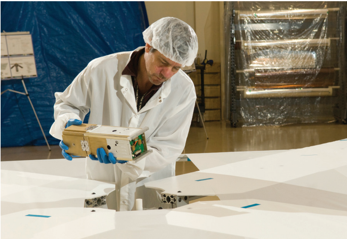
NanoSail-D served as a proof-of-concept for deployable solar sail technologies.

The Center has been involved in solar sail research from concept to flight. In 2004, Marshall helped test the strength, stiffness, and behavior of two competing designs. These led to NanoSail-D and Sunjammer. NanoSail-D, which Marshall managed in 2010, became NASA's first solar sail to achieve orbit. The 100-square-foot polymer sail demonstrated deployment of a compact solar sail boom technology. NEA Scout, launching in 2018 as a secondary payload on SLS Exploration Mission 1, will use a solar sail to reach a near-Earth asteroid for observations. Potential solar sail missions include polar-stationary Earth observations, heliophysics, NEO reconnaissance, interstellar precursors, orbital debris mitigation and small satellite propulsion.