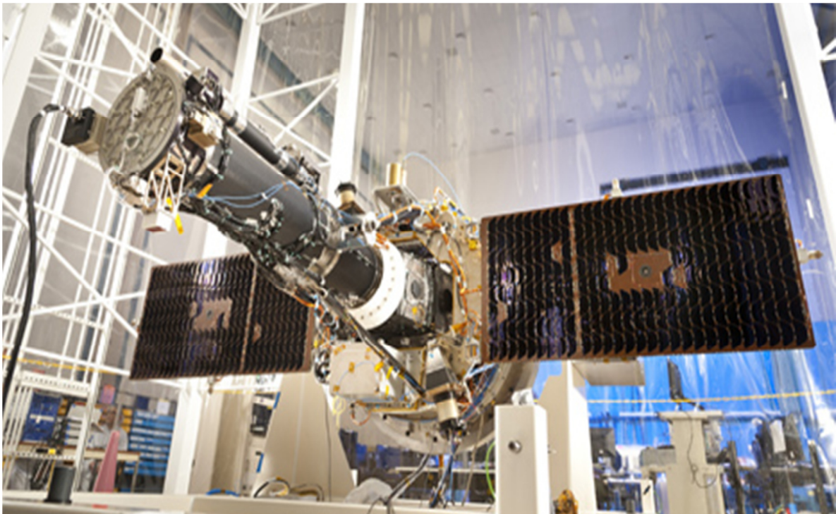
Image Caption: NASA's Interface Region Imaging Spectrograph with solar panels in flight position during pre-flight checkouts in the clean room at Lockheed Martin Advanced Technology Center in Palo Alto, Calif.

Maximum Downlink Rate: The science X-band data rate is 15 Mbps, delivered over 15 downlink passes, for a total rate of 60 gigabits/day.