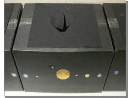
A sample Comet Mystery Box

Set Comet Mystery Boxes, hand wipes, and comet pictures in an area that is accessible to students.